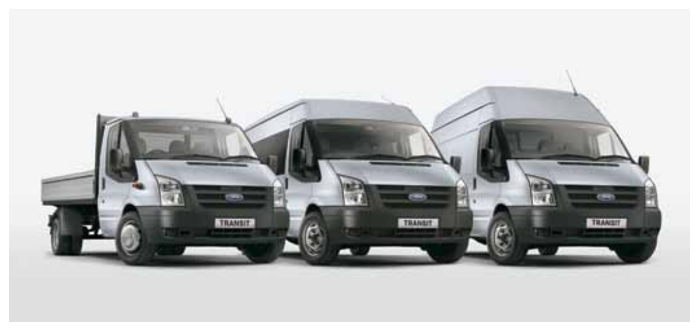
The Ford Transit line-up makes choosing the right van, cab chassis or bus for your business simple. The Transit range definitely means business with bold exterior styling, diesel power, advanced safety and superior comfort. Left to right: Transit Cab Chassis shown with aftermarket tray, Transit Bus, and Transit Van LWB shown with high roof and optional full partition.