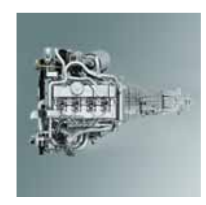
The 2.4 litre Duratorq turbo diesel engine on rear-wheel-drive models features advanced high pressure common rail technology to boost performance and efficiency.

Running a business can be non-stop day in and day out. That's why you need a vehicle that can keep pace with your demands. The Transit Cab Chassis has all the power you need thanks to its 2.4L 103kW high pressure common rail Duratorq turbo diesel engine. Matched with a six speed manual transmission and offering a tireless 375Nm of torque at 2000rpm, this super responsive diesel reacts instantly to the driver's demands. Whether it's negotiating congested city traffic or getting in and out of rugged worksites, Transit is up to the task. What's more, it can keep a lid on your running costs thanks to its excellent fuel economy. Plus, Transit's intelligent Green Shift Indicator highlights the optimum point at which to make an upward gear change. This can further maximise fuel economy by helping to avoid unnecessarily high engine speed, therefore cutting fuel costs and reducing CO<sub>2</sub> emissions. And with rear-wheel-drive muscle working for you, you're able to effortlessly handle bigger payloads and tow up to 3,000kg." When it comes to getting the toughest job done right, the Transit won't let you down. You can depend on it.