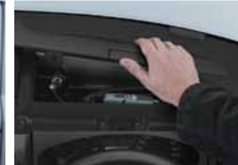
The remote central locking key fob incorporates an One of the two lidded storage compartments on the Clever ideas include rails in the larger than normal discreetly charge a mobile phone away from prying eyes. 2-litre bottles.