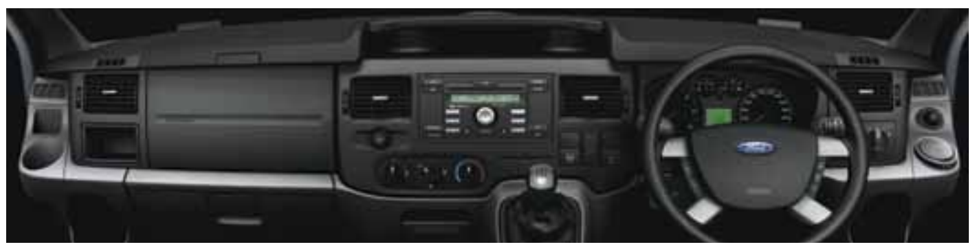
The feature-packed interior makes time at the wheel more comfortable. Optional Professional Pack interior shown.