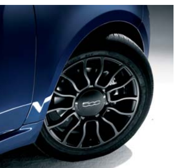
Fiat 500 TwinAir dualogic gearbox (optional) 15" Total Black alloy wheels

And it's a well known fact that the details make the difference . On the Fiat 500 TwinAir, they're not in short supply, for example the satin chrome details, Total Black alloy wheels and body-coloured mirrors. What's more, the chrome-plated exhaust pipe, spoiler, and exclusive Piano Black roof (available as an option on the TwinAir Plus) make the TwinAir sporty and appealing, perfect for your dynamic side.