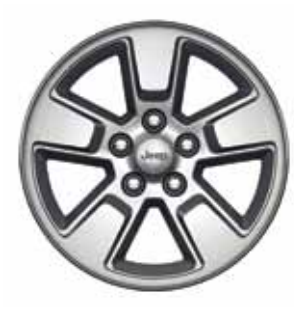
SPORT 16-inch Aluminium with Mineral Grey Accents > Standard on Cherokee Sport