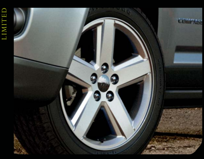
18-inch Ultra-Bright Machine Cast Aluminium Wheels