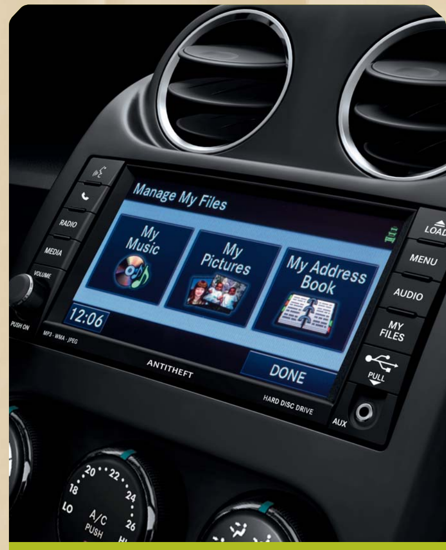
MEDIA CENTRE 730 CD/DVD/HDD/NAV RADIO. Go anywhere, hear everything with this advanced multimedia system. Hands-free communication lets you talk safely on the phone, text, or operate the radio. It arrives loaded with a hard drive to store your media.

NAVIGATION. Enjoy safe travels with the available GPS Navigation, providing voice guidance and visual display. It can also locate nearby petrol stations, restaurants, shopping, hospitals or points of local interest.