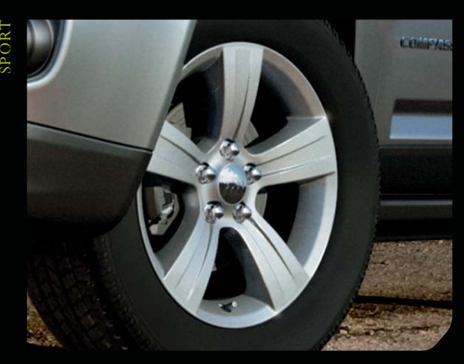
17-inch Painted Aluminium Wheels