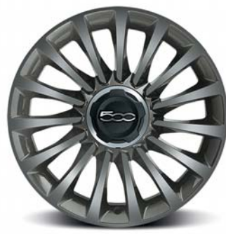
LINEACCESSORI 17" 225/45 R17 ECOREFLEX GREY ALLOY WHEELS