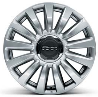
433 16" SILVER ALLOY WHEELS

5EQ 17" TREKKING ALLOY WHEELS GLOSSY BLACK DIAMOND FINISHED AND M+S (MUD&SNOW) ALL-SEASON TYRES