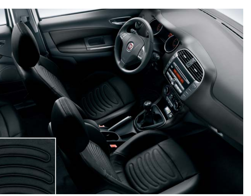
485 Black Leather