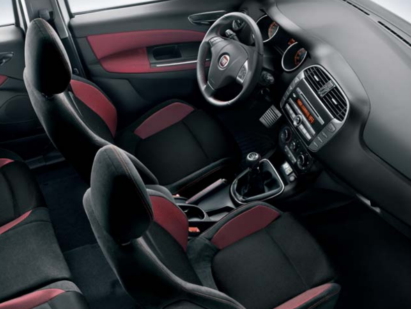
Easy 365 Red Sail Cloth