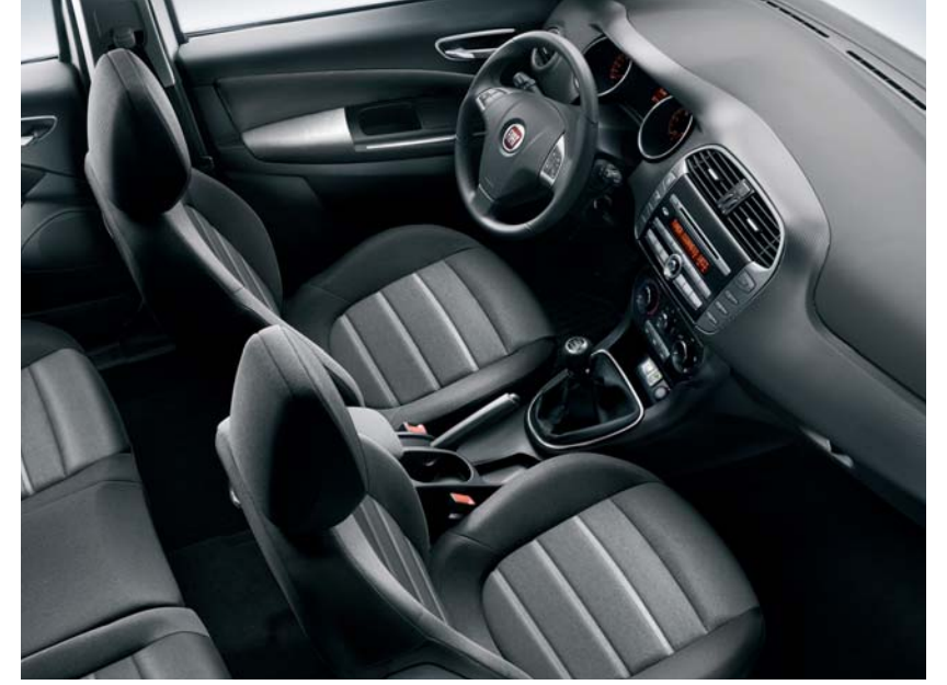
Easy 157 Grey Cloth