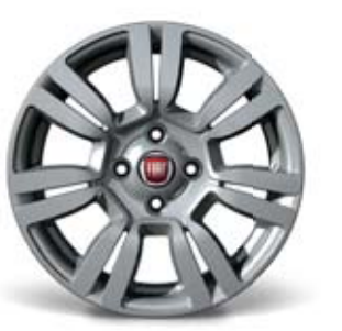
15" Comfortline Alloy Wheels