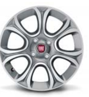
16" 7 Spoke 2-tone Sportline Alloy Wheels