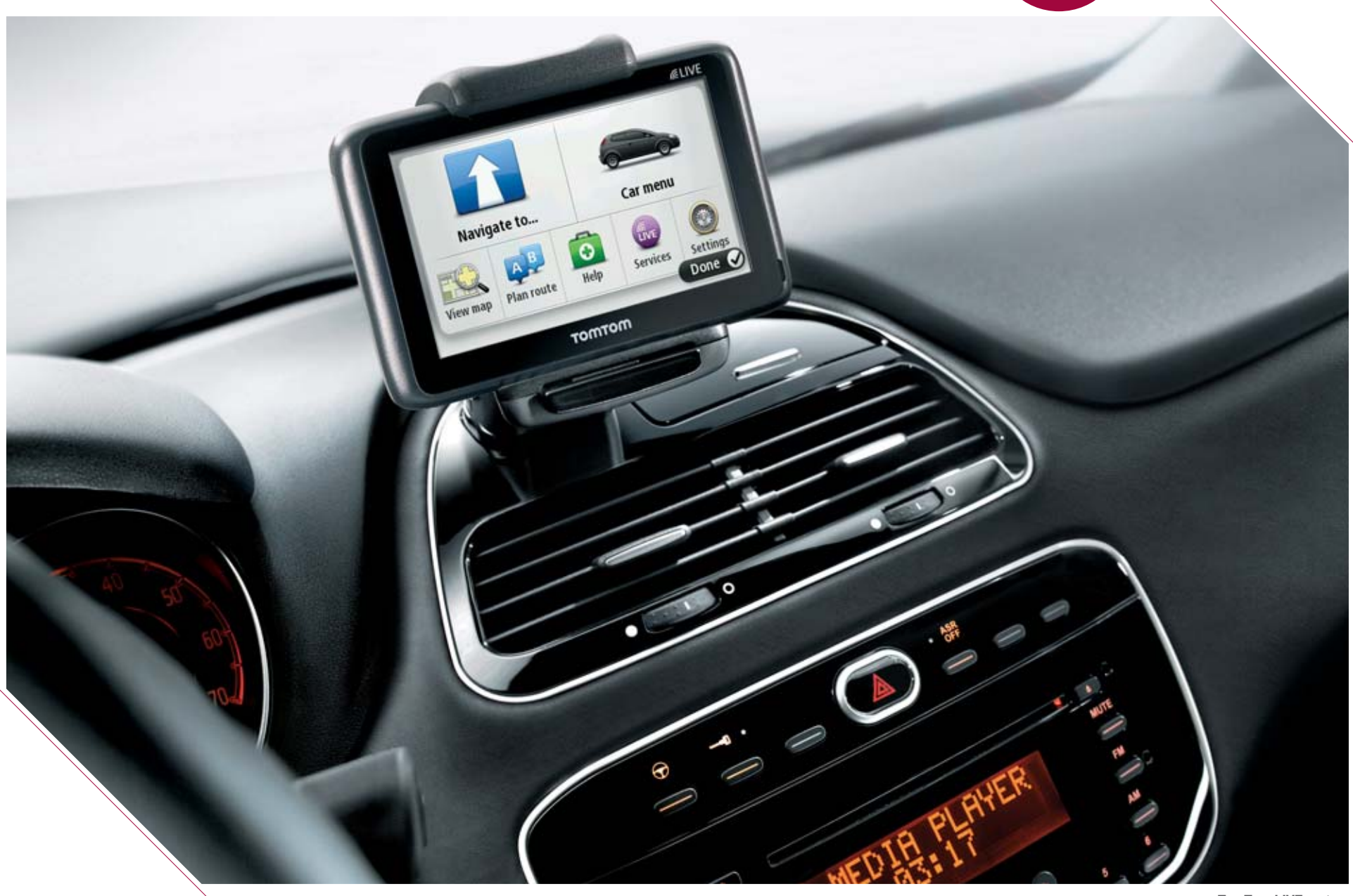
TomTom LIVE system