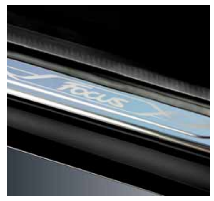
Scuff plates. Elegant polished stainless steel scuff plates, with etched 'Focus' script.