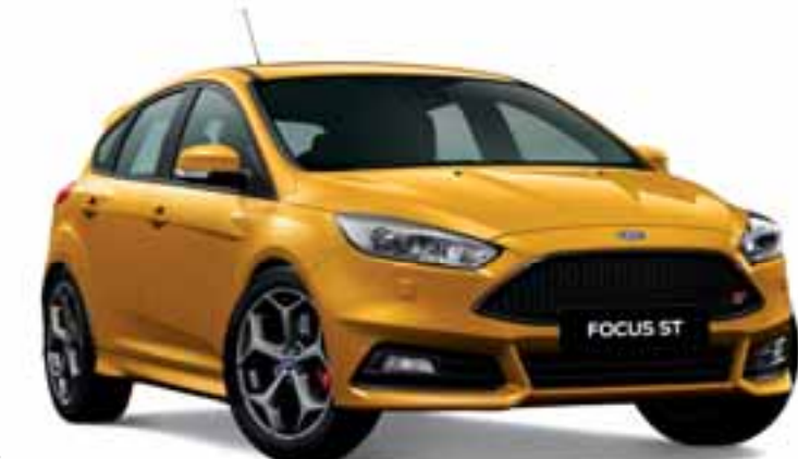
Focus ST show in Tangerine Scream.<sup>8.</sup>

1. All performance data measured using 95RON fuel. 2. Fuel consumption and emissions as per ADR 81/02 (combined cycle) and to be used for vehicle comparison purposes only. It is unlikely that this fuel consumption figure will be achieved in real world driving conditions. Actual fuel consumption will depend on many factors including the driver's habits, prevailing conditions and the vehicle's equipment, condition and use 3. SYNC®2 not compatible with all phones, for full compatibility please visit www.ford.com.au/sync 4. Not all SYNC®3 features are compatible with all phones. Ford Applink™ is only compatible with select smartphones, for compatibility please check www.ford.com.au/sync/support 5. Bluetooth® is a registered trademark of Bluetooth SIG Inc. and is used under license. Always check your local road laws. 6. Dynamic Stability Control is also known as Electronic Stability Control. 7. To use Emergency Assistance you must have a paired phone within mobile range. 8. Tangerine Scream is a prestige paint option that incurs an additional charge.