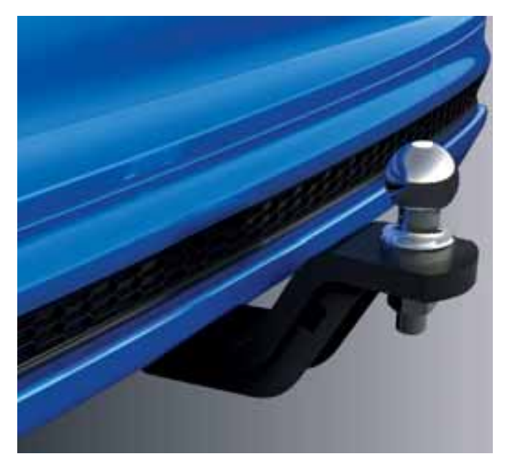
Tow pack. Whether your towing requirements are for work or play, the Genuine Ford Tow Pack will make towing a breeze.