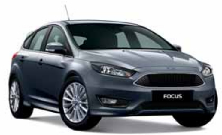
Focus Sport shown in Magnetic.1.