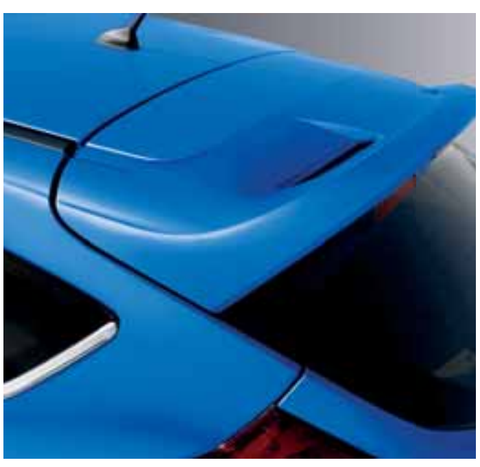
Hatch rear spoiler – large. This accessory gives an aerodynamic finish to the roof line.