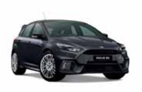
Shadow Black* Magnetic*