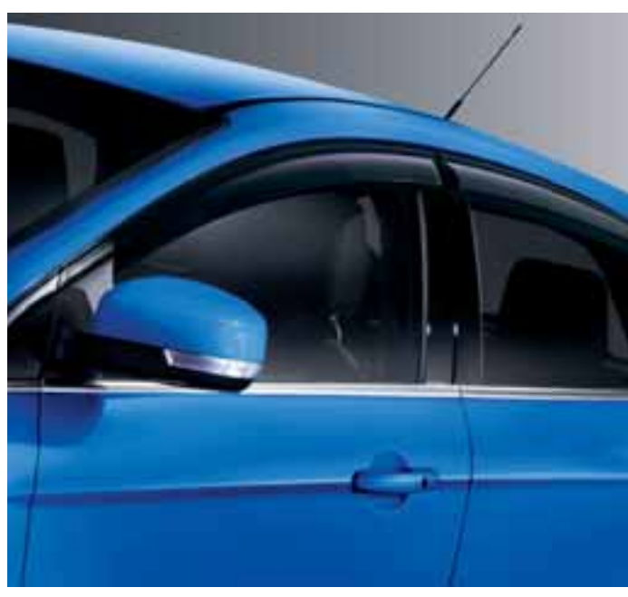
Weathershield. Reduces wind turbulence and noise, allowing you a more enjoyable drive with the windows down, even during light rain. Front and rear available.