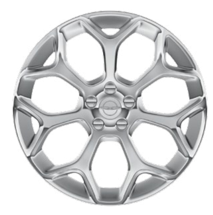
WDE - 20-Inch Alloy Wheels (Standard on 300C Luxury)