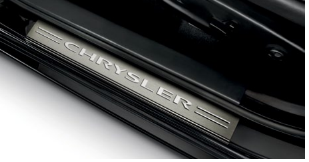
ILLUMINATED DOOR SILL GUARDS