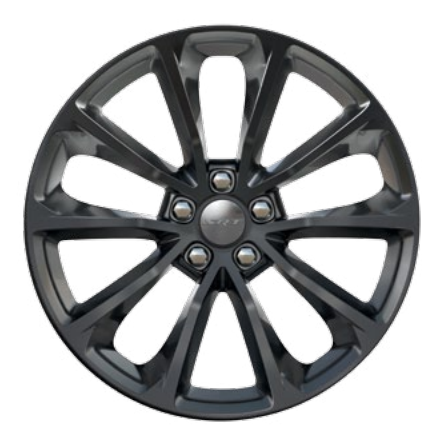
WSM - 20-Inch Forged Alloy Wheels (Standard on 300 SRT)