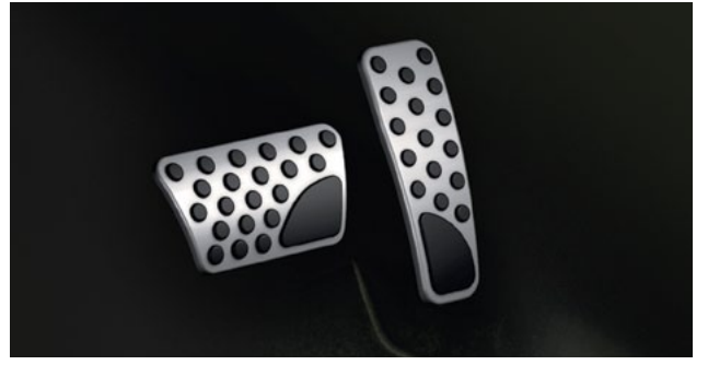
BRIGHT PEDAL KIT