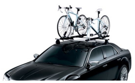
ROOF-MOUNT BIKE CARRIER