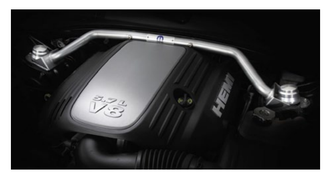
STRUT TOWER BRACE