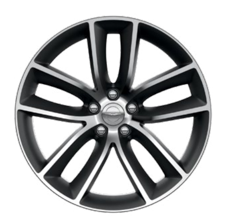
WR2 - 20-Inch Alloy Wheels (Standard on 300 SRT Core)