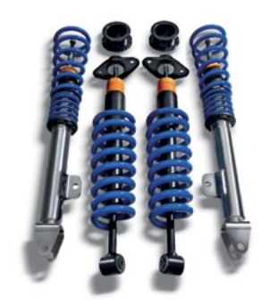
PERFORMANCE SUSPENSION KIT