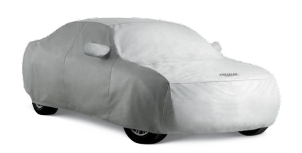
FULL VEHICLE COVER