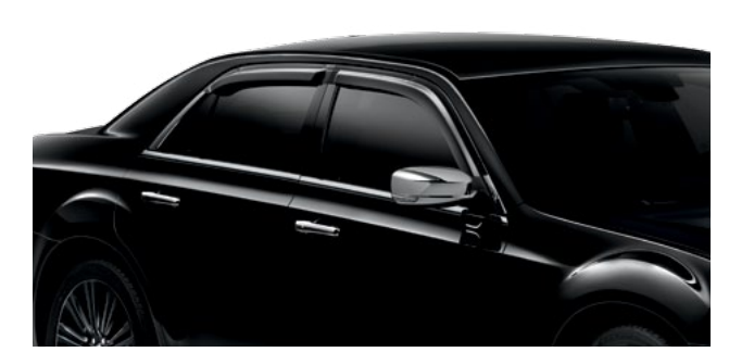
SIDE WINDOW AIR DEFLECTORS