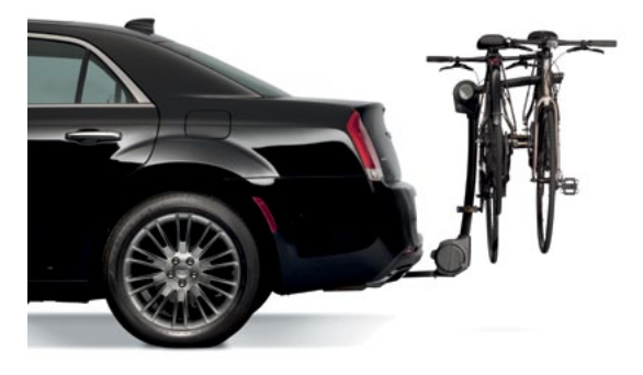
HITCH-MOUNT BIKE CARRIER