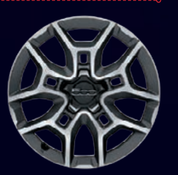
208 - 18" Alloy wheels Summer tire 225/45 R18 (optional on City Cross)