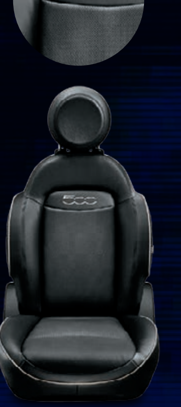
Black leather with ivory piping and black door inserts

500X 687 URBAN 497 CITY CROSS 539 CROSS PLUS