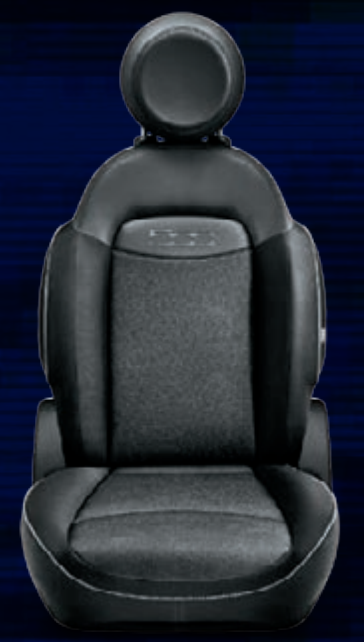
Black & Denim Fabric with grey piping and black door inserts