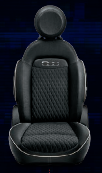
Black and Grey Fabric with ivory piping and black door inserts