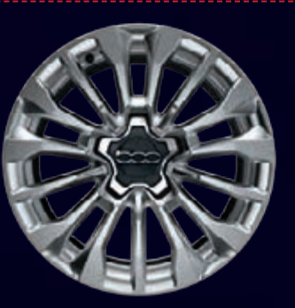
5ZZ 17" Silver Alloy wheels Summer tire 215/55 R17 (optional on City Cross)