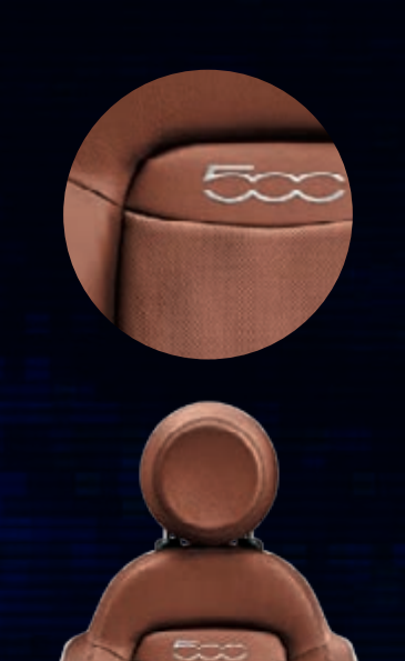
Brown leather with ivory piping and brown door inserts

500X 687 URBAN 497 CITY CROSS 539 CROSS PLUS