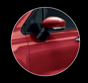
296 601 ICE WHITE CINEMA BLACK