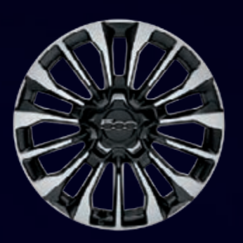
OR2- 17" Alloy wheels Summer tire 215/55 R17 (standard on City Cross)