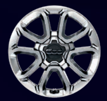
5FB - 16" Alloy wheels Summer tire 215/60 R16 (standard on Urban)