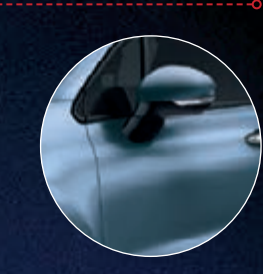
994 BLUE JEANS