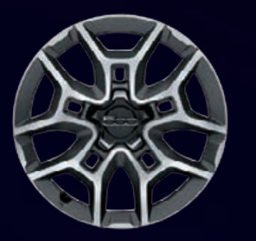
208 - 18" Alloy wheels Summer tire 225/45 R18 (standard on Cross Plus)