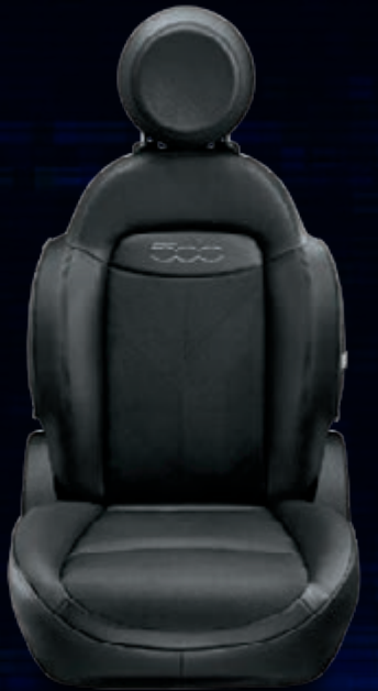
Grey Fabric with black technoleather inserts with grey piping and black door inserts