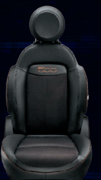
Copper Fabric with black technoleather inserts with copper piping and black door inserts