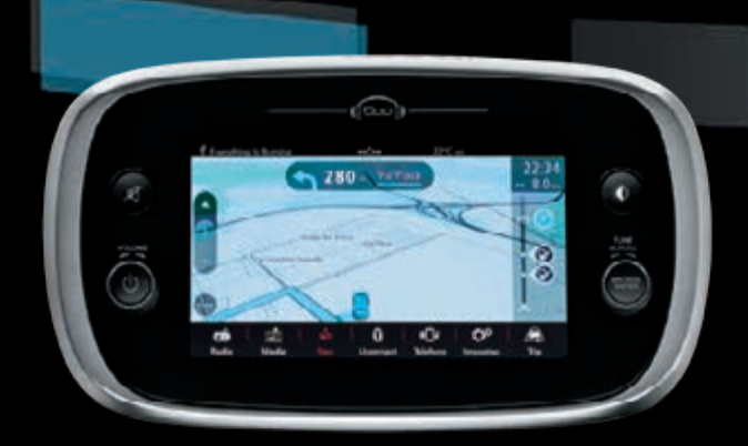
UCONNECT™ 7" HD LIVE