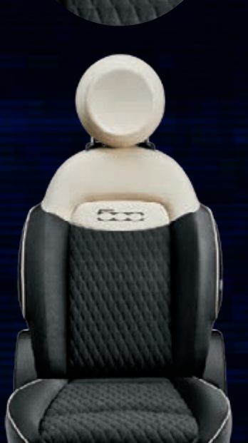
Ivory and Grey Fabric with ivory piping and door inserts