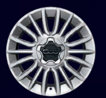
9GF - 17" Matt Silver Alloy wheels Summer tire 215/55 R17 (optional on Urban)