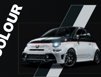
Scorpione Black / Gara White