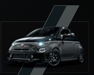
Scorpione Black / Record Grey