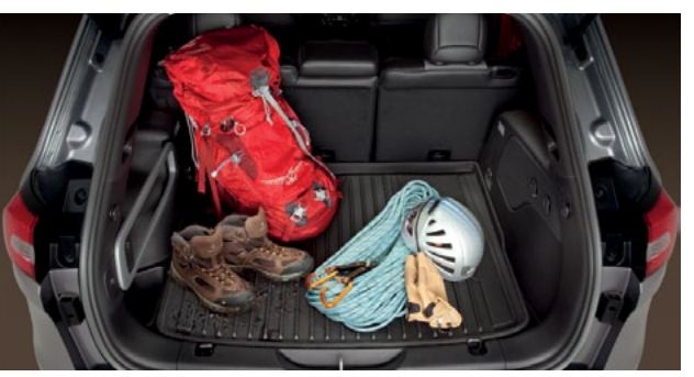
MOULDED CARGO MAT