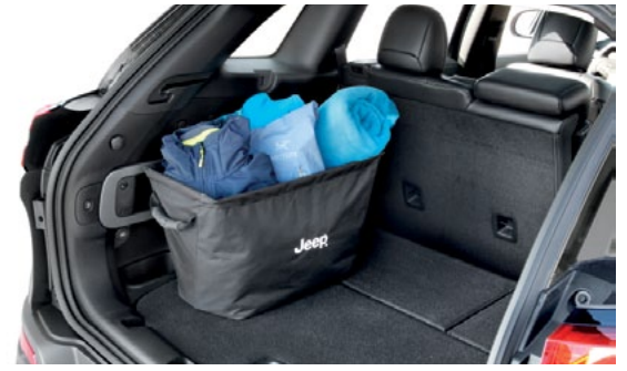
COLLAPSIBLE CARGO TOTE