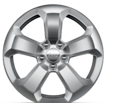
WGN - 17-Inch Alloy Wheels (Standard on Sport)