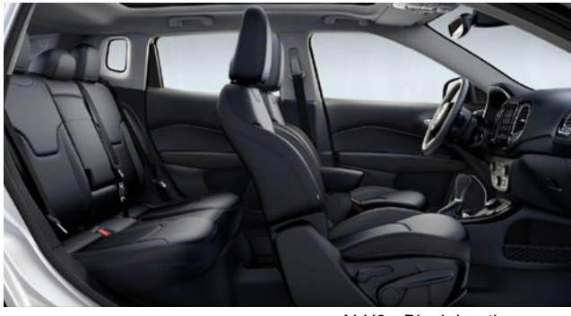
ALX9 - Black Leather