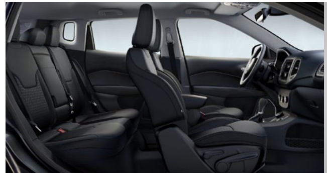
A7X9 - Black Cloth (Standard - Sport & Longitude)