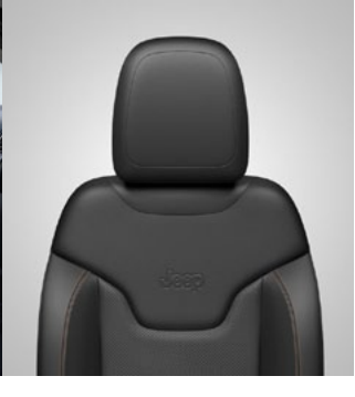
(Standard - Limited)