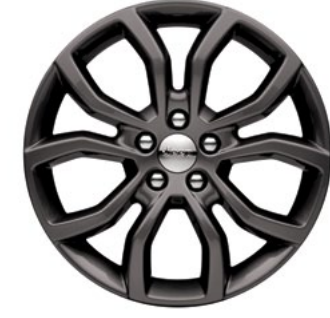
18-INCH HIGH-GLOSS GRANITE CRYSTAL WHEEL