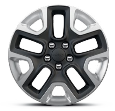
WFC - 17-Inch Off-Road Alloy Wheels (Standard on Trailhawk)