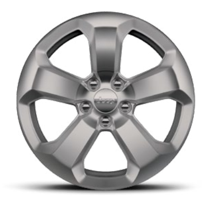
WAC - 17-Inch Alloy Wheels (Standard on Longitude)