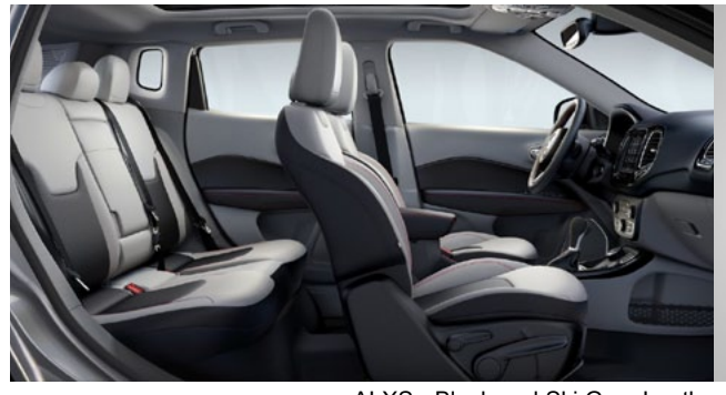
ALXS - Black and Ski Gray Leather (No Cost Option - Limited)