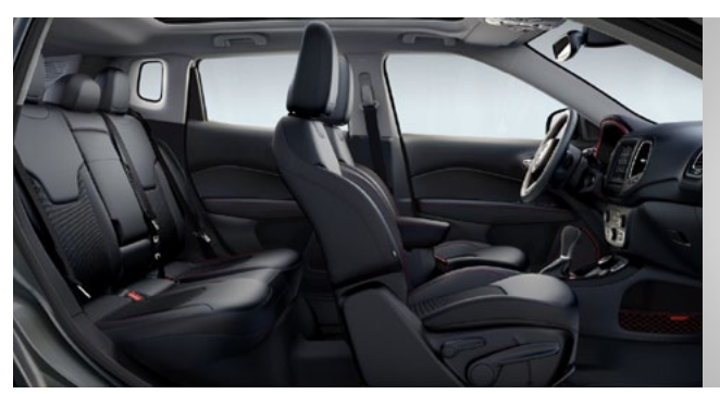
Q6XC - Black Cloth and Leather (Standard - Trailhawk)