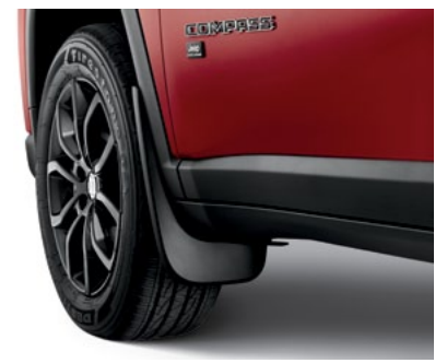
CUSTOM BONNET AND BODY SIDE GRAPHICS