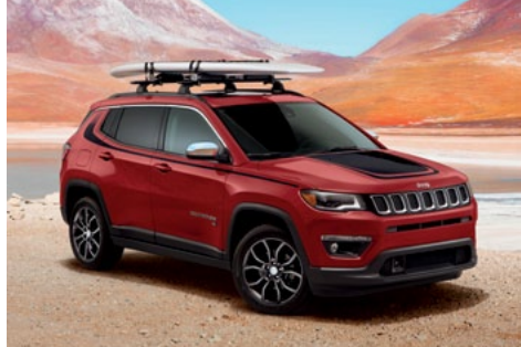
ROOF-MOUNT SKI AND SNOWBOARD CARRIER