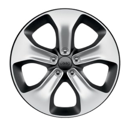
WPW - 18-Inch Alloy Wheels (Standard on Limited)