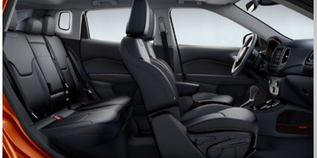
TLXC - Black Leather (Option - Trailhawk)