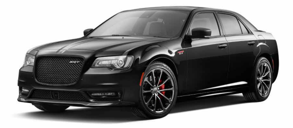
PX8 - Gloss Black (Standard)