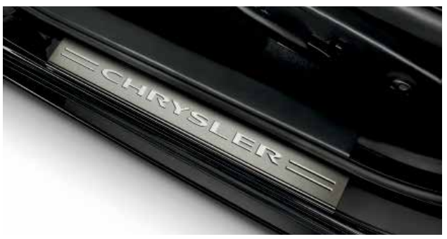
ILLUMINATED DOOR SILL GUARDS