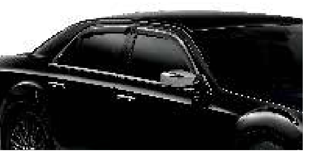
SIDE WINDOW AIR DEFLECTORS