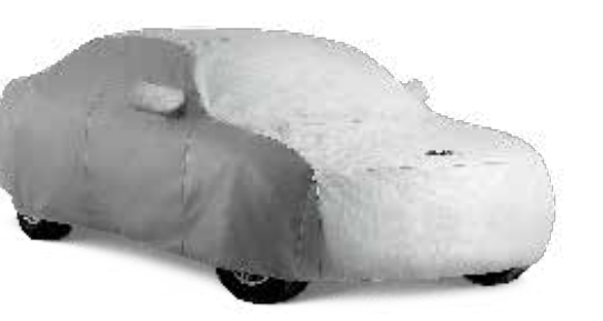
FULL VEHICLE COVER