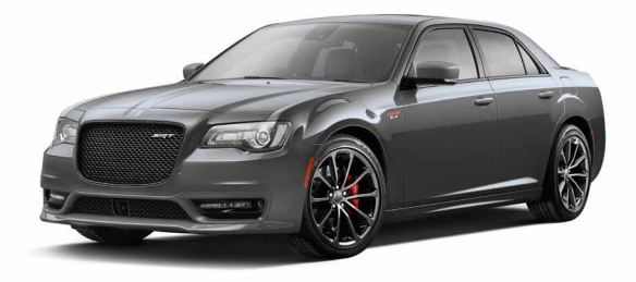
PDN - Ceramic Grey (Option)