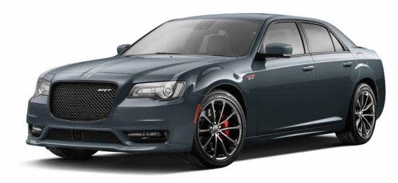
PAR - Maximum Steel (Option)