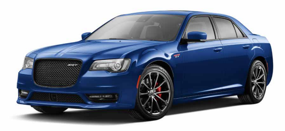
PBM - Ocean Blue (Customer Order Only)