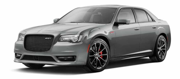
PSE - Silver Mist (Option)