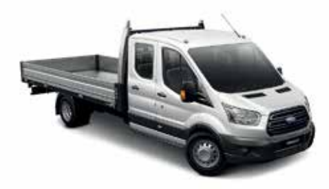
Transit 470E RWD Double Cab Chassis