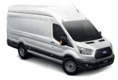
Transit 470E RWD Jumbo Van