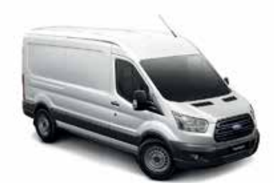
Transit 350L LWB FWD Van