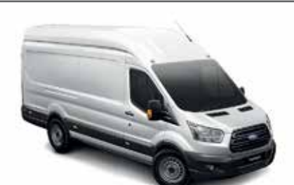
Transit 350E RWD Jumbo Van