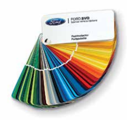
100+ Special Vehicle Option (SVO) Paint options