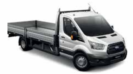
Transit 470E RWD Single Cab Chassis