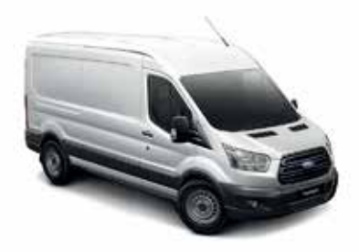
Transit 350L LWB RWD Van