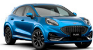
Desert Island Blue**