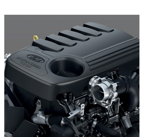
3.2L Turbo Diesel with 6 speed auto