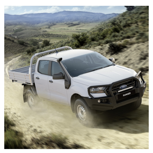
Switch on the Fly 4x4 with eLocking Rear Differential