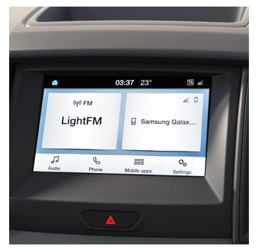
SYNC®3 with Apple CarPlay™ & Android Auto™3,4.