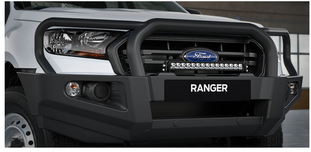
Ford Genuine Bullbar & LED Light Bar