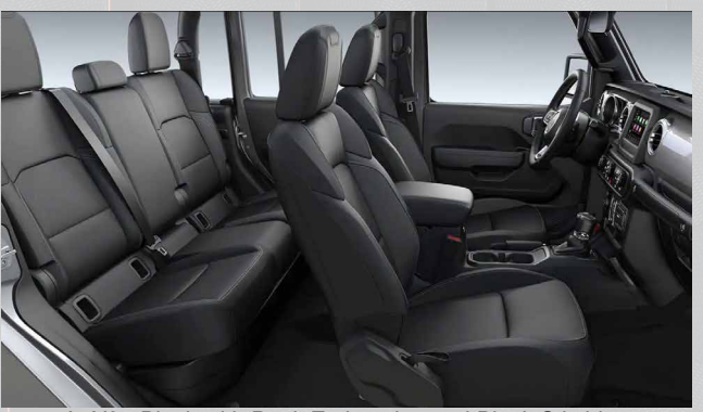
A7X9 - Black with Peak Embossing and Black Stitching (Standard - Sport S)