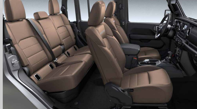
MLTV - Black/Dark Saddle McKinley Leather with Overland Logo (Option - Overland)