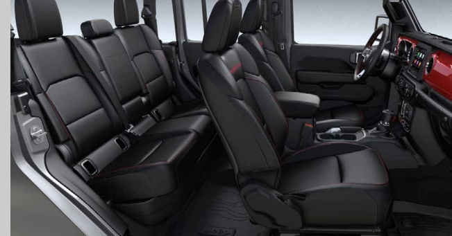
ALX9 - Black Leather Trimmed Bucket Seats (Option - Rubicon)