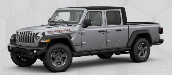
PSC - Billet Silver (Option)