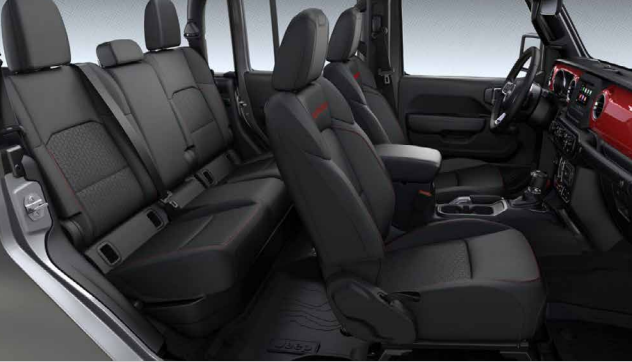
D5X9 - Black Premium Cloth Low-Back Bucket Seats (Standard - Rubicon)