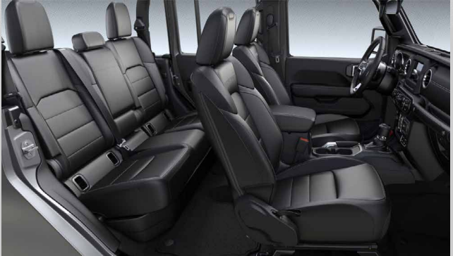
MLX9 - Black McKinley Leather with Overland Logo (Standard - Overland)