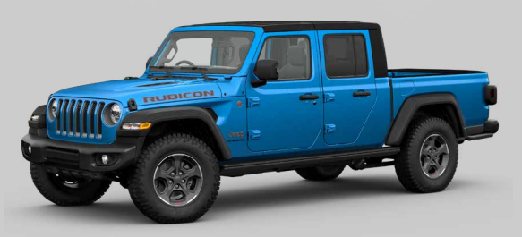
PBJ - Hydro Blue (Option)