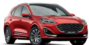
Rapid Red *^