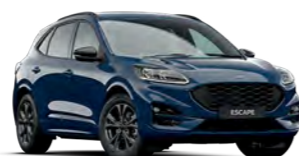
Blazer Blue +