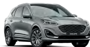
Solar Silver *^