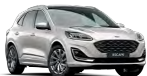
White Platinum *^