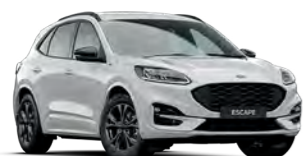
Frozen White +

Colour Range *Prestige Paint is an option that incurs an additional charge ^ Available on all models + Available on Escape and ST-Line models only