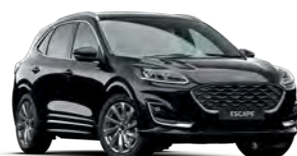
Agate Black ^