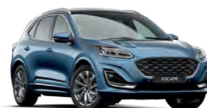
Blue Metallic *^