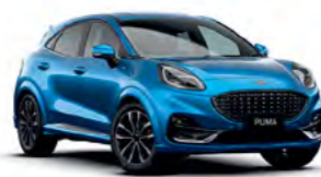
Desert Island Blue*^