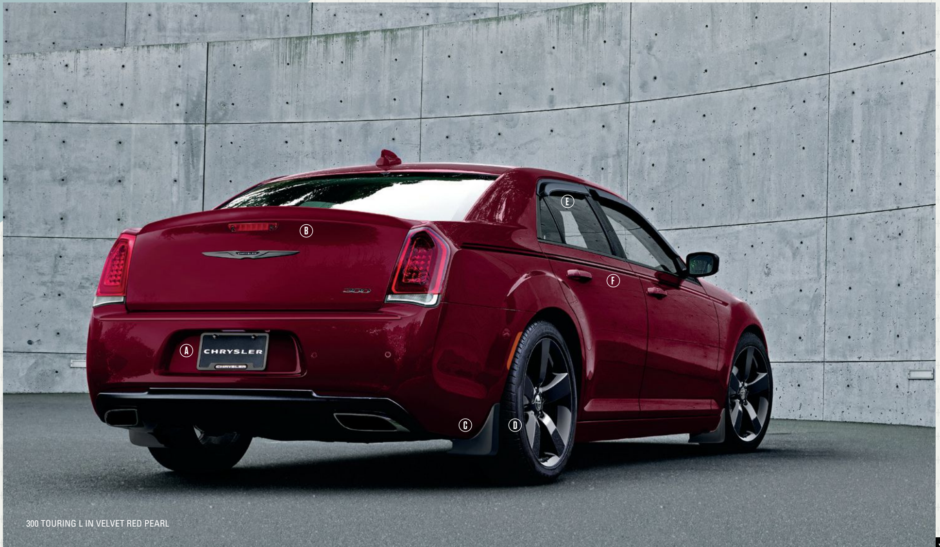
300 TOURING L IN VELVET RED PEARL

Not all part numbers shown. See dealer for additional part numbers by vehicle application.