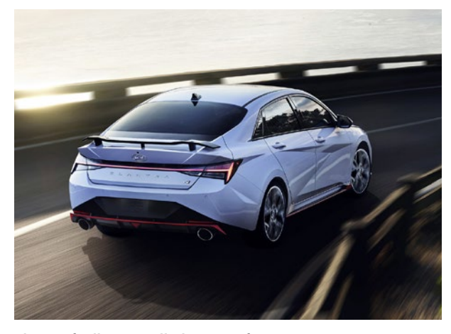
Electronically Controlled Suspension (ECS) Allows optimal control of damping force of suspension to suit the driving situation and offers a clearly differentiated ride feel according to drive mode.

Electronic Limited-Slip Differential (e-LSD) The ELANTRA N provides world-class cornering ability with an electronically controlled, mechanical limitedslip differential. This system uses true torque vectoring to intelligently and precisely distribute torque where it's needed most. This increases cornering speed and reduces understeer for enhanced handling agility.