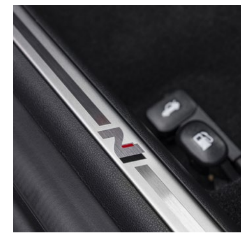
Aluminum N door scuff