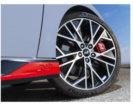
N 19" alloy wheels with Michelin Pilot Sport 4S summer tires N logo engraved side moulding with red accents*