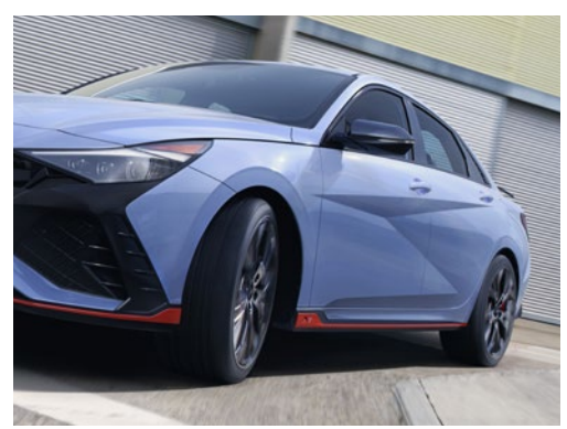
Side body with sculpted Parametric surfaces