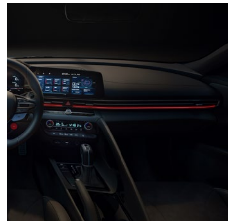
Interior ambient light (64 colours)