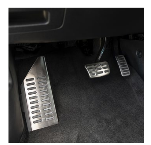
Alloy sport pedals