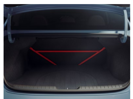
Rear strut bar offers an enhanced body rigidity increase of 29%, compared to the standard ELANTRA model

*Red accents not applicable to Fiery Red exterior colour. Dark grey accents will be applicable for Fiery Red exterior colour.