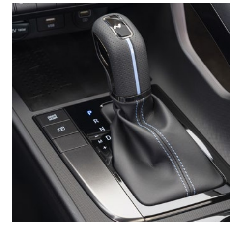
N gear shift knob