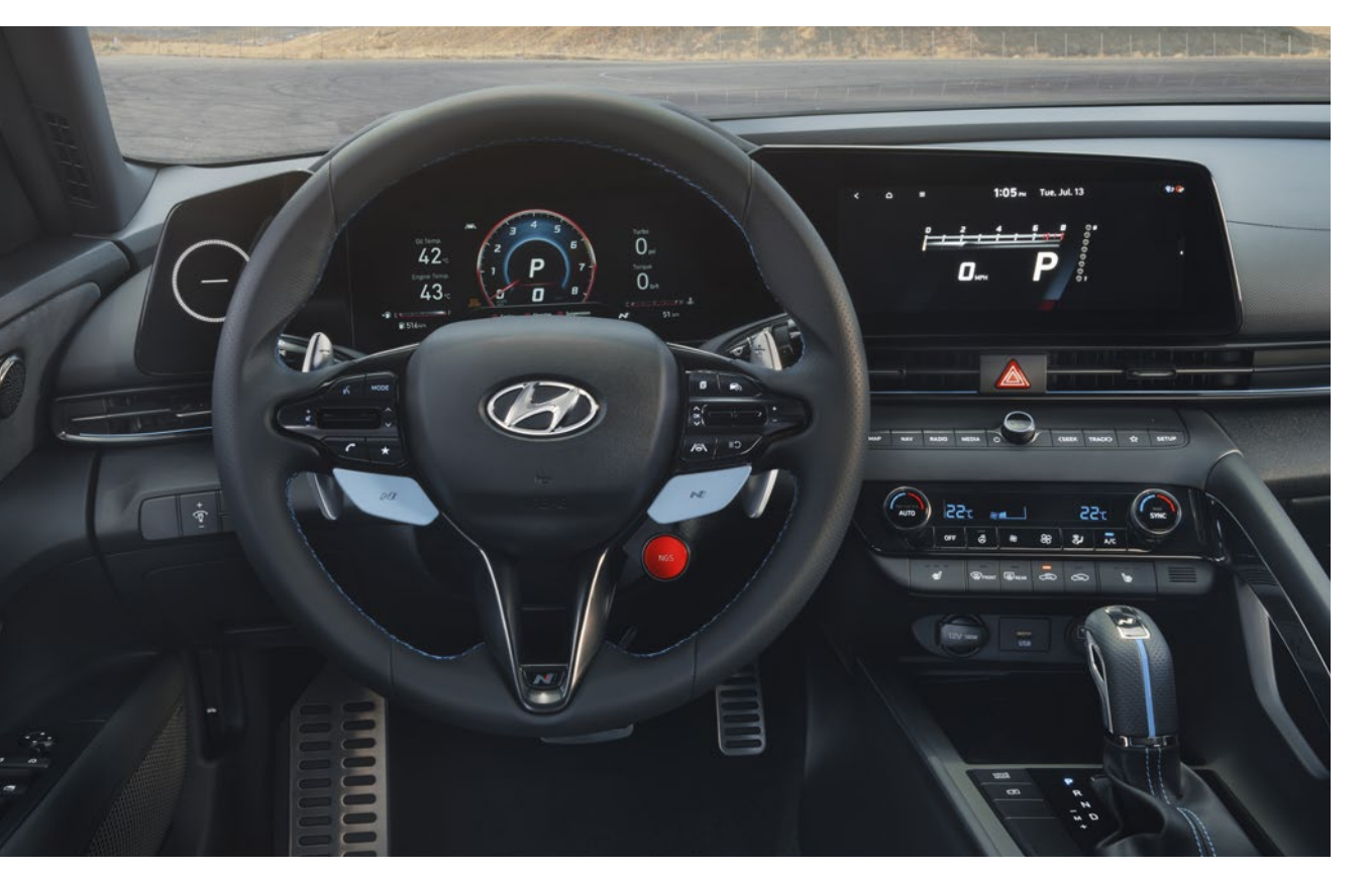
Dual 10.25" touch-screen navigation system and full digital instrument cluster

And stay connected to your vehicle and the world with Bluelink®<sup>0</sup> and a three-month trial of SiriusXM™<sup>s</sup> satellite radio.