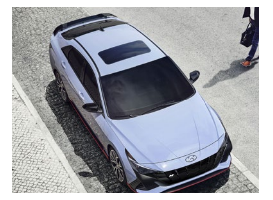
Power tilt-and-slide sunroof