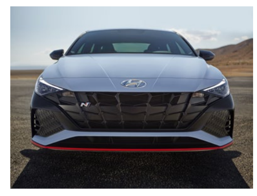
N front fascia with unique red front lip*

The ELANTRA N doesn't just turn corners, it turns heads. From its race car-inspired N front fascia with stunning red lip* to its parametrically sculpted side body with N logo engraved side moulding with red accents* to its wing-type rear spoiler and N rear bumper and diffuser, everything about the exterior of the ELANTRA N exudes performance.