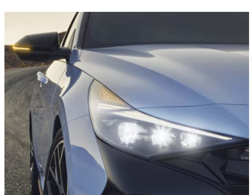
LED projection-type headlights LED daytime running lights LED mirror-mounted turn signals