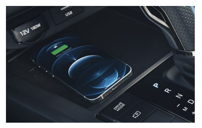
Wireless charging pad<sup>▼</sup>