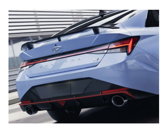
Wing-type rear spoiler N rear bumper and diffuser Variable exhaust valve system with dual outlets