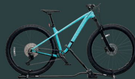
PRORIDE XT ROOFTOP BIKE RACK

Accommodates up to two snowboards, six pairs of skis or a combination of both.