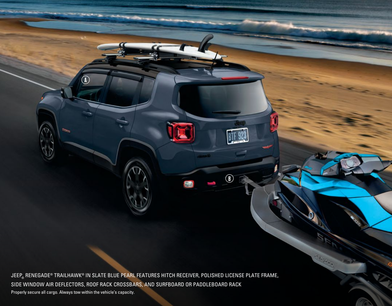
JEEP® RENEGADE® TRAILHAWK® IN SLATE BLUE PEARL FEATURES HITCH RECEIVER, POLISHED LICENSE PLATE FRAME, SIDE WINDOW AIR DEFLECTORS, ROOF RACK CROSSBARS, AND SURFBOARD OR PADDLEBOARD RACK Properly secure all cargo. Always tow within the vehicle's capacity.

A. SIDE WINDOW AIR DEFLECTORS. Reduce wind noise and allow windows to be open even during inclement weather. For vehicles equipped with production side rails. [82214056]