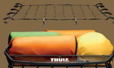
CANYON XT ROOF BASKET