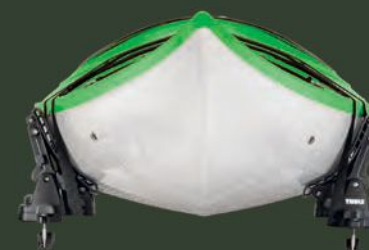
DOCKGRIP HORIZONTAL KAYAK RACK