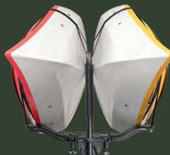
COMPASS VERTICAL KAYAK RACK Accommodates up to two kayaks, two stand up paddleboards or a combination of both.