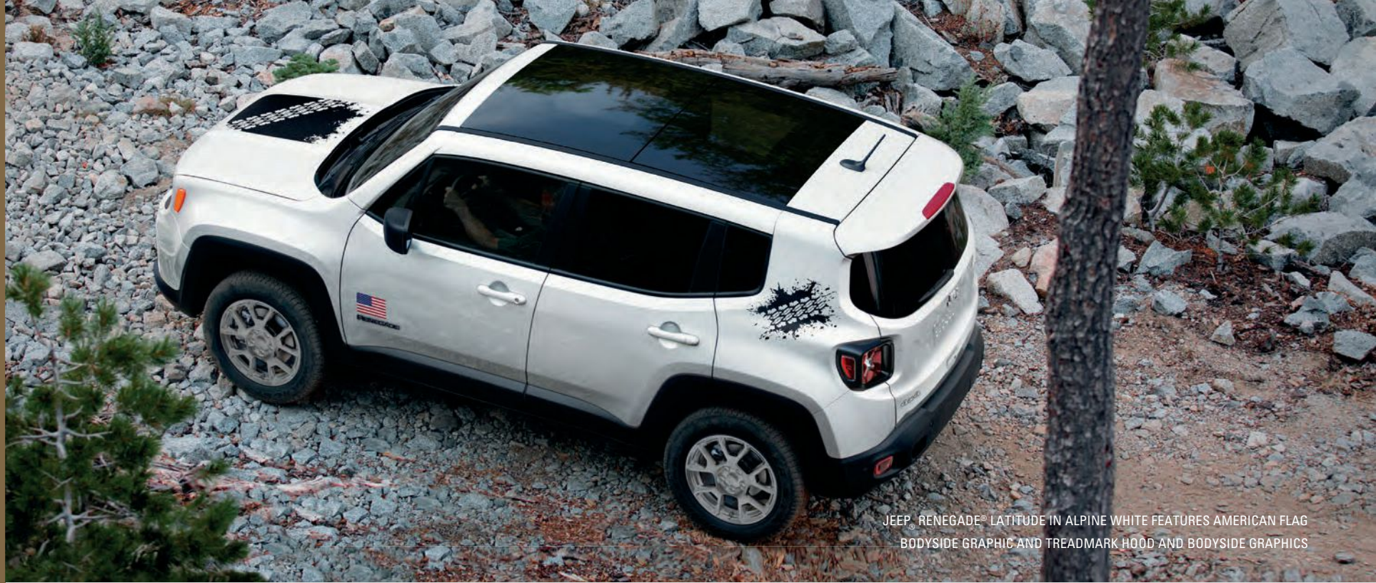
JEEP® RENEGADE® LATITUDE IN ALPINE WHITE FEATURES AMERICAN FLAG BODYSIDE GRAPHIC AND TREADMARK HOOD AND BODYSIDE GRAPHICS