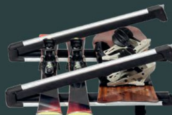
SNOWPACK L SKI AND SNOWBOARD RACK

Accommodates up to two snowboards, six pairs of skis or a combination of both.