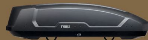
FORCE XT ROOF BOX Available in two sizes: L and XL.