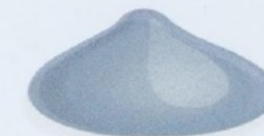
Light Denim Blue Clearcoat Metallic