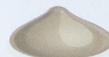
Light Prairie Tan Clearcoat Metallic