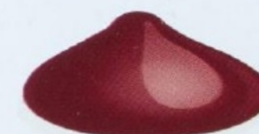
Dark Toreador Red Clearcoat Metallic