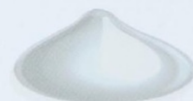
Vibrant White Clearcoat