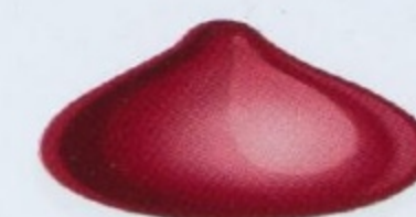
Toreador Red Clearcoat Metallic