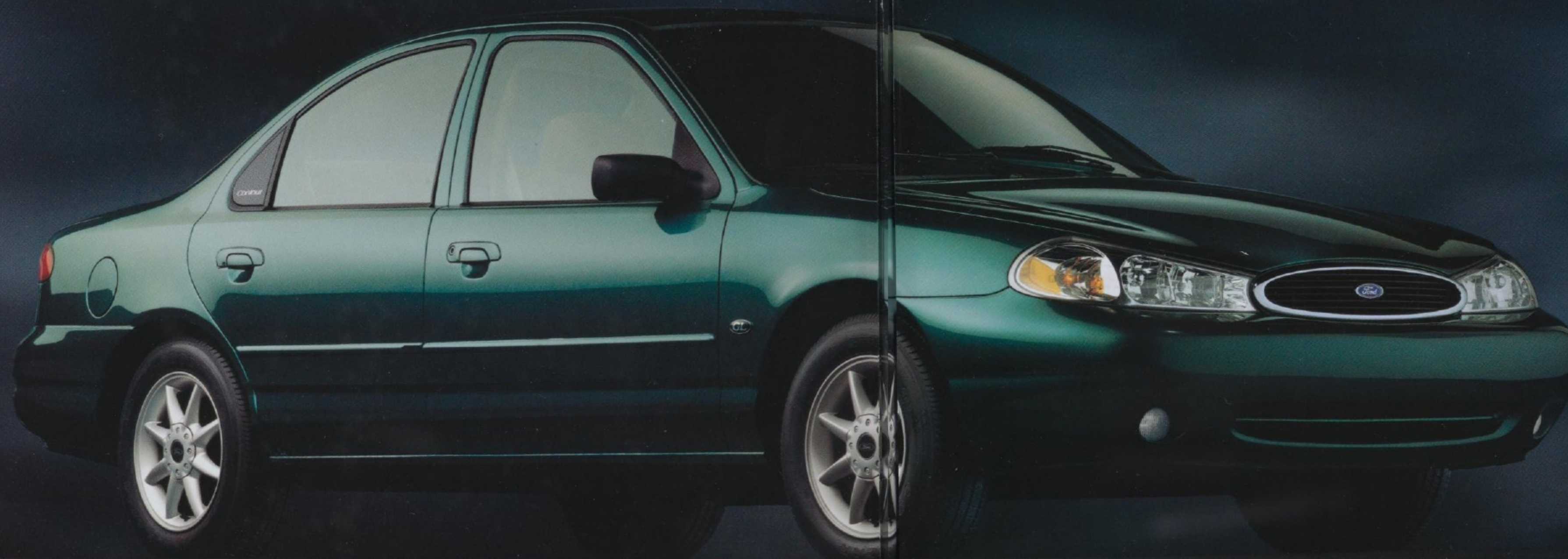
Above: Contour GL with the optional Sport Package in Pacific Green Clearcoat Metallic. Left: Contour GL in Willow Frost Clearcoat Metallic shown with optional rear wing spoiler.