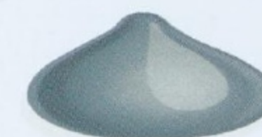
Willow Frost Clearcoat Metallic