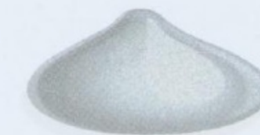
Silver Frost Clearcoat Metallic