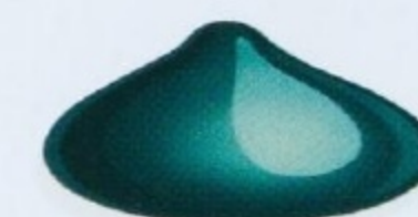
Pacific Green Clearcoat Metallic