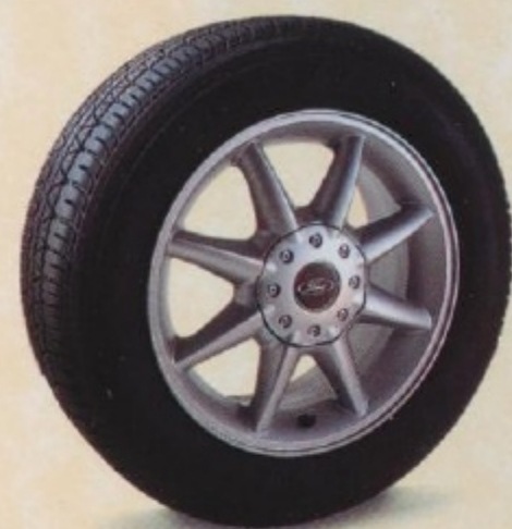
15" aluminum wheels, part of the Sport Package and optional with GL and LX, complement the new Contour styling.

Looks are important, there's no doubt about it. We want our cars to look good. You want your car to look good. With a look that reflects its spirit. Contour has refined styling for 1998. A look that's smart, sophisticated.