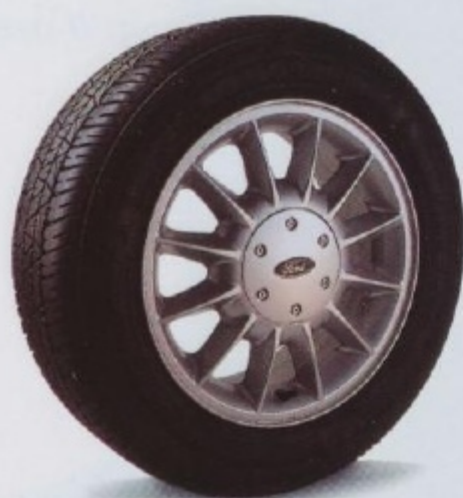
Standard SE cast aluminum wheel.

As difficult as it is for some to believe, there are people who view automobiles merely as vehicles of transportation. A curious perspective, to say the least. Contour is for the others, those who know that driver reward is the real issue. Confident passing. Sure cornering. A new sense of adventure traveling a familiar route. And a look forward to tomorrow's commute.