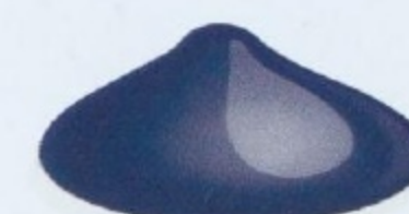
Moonlight Blue Clearcoat Metallic