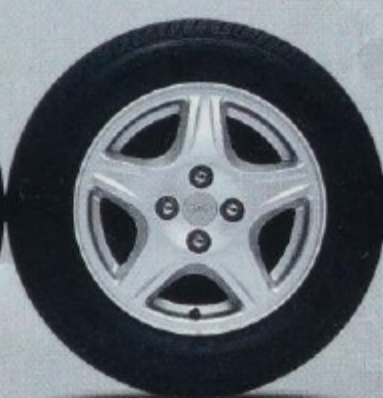
Optional 5-spoke aluminum wheel