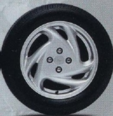
Aluminum sport wheel (included with optional Sport Package)