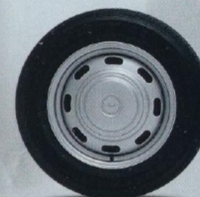
Standard argent wheel with bright half cap

Following publication of the catalog, certain changes in standard equipment or options, or product delays, may have occurred which would not be included in these pages. Ford reserves the right to change product specifications at any time without incurring obligations.