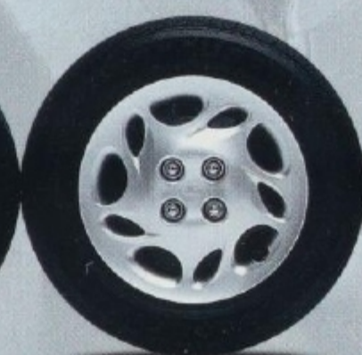
Styled steel wheel and full wheel cover with "bolt on" appearance