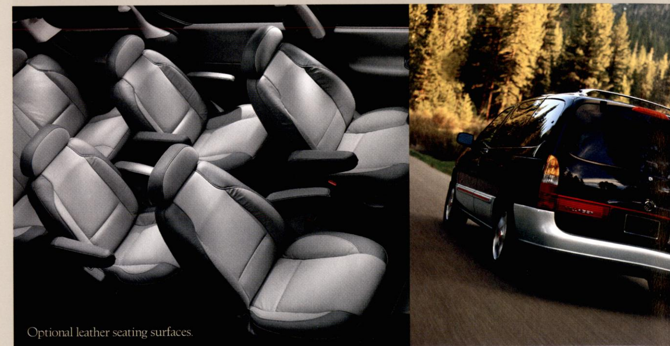
Optional leather seating surfaces.

The new 1999 Villager has been restyled inside and out. It features a more powerful engine, more interior room and a new driver's side sliding door.