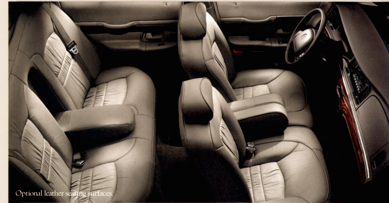
Optional leather seating surfaces.

The Grand Marquis legacy continues. It can seat six people comfortably. It also provides a remarkably smooth, even ride. Its V-8 engine has the kind of power you'll appreciate — especially in the passing lane. And it comes with a long list of standard features.