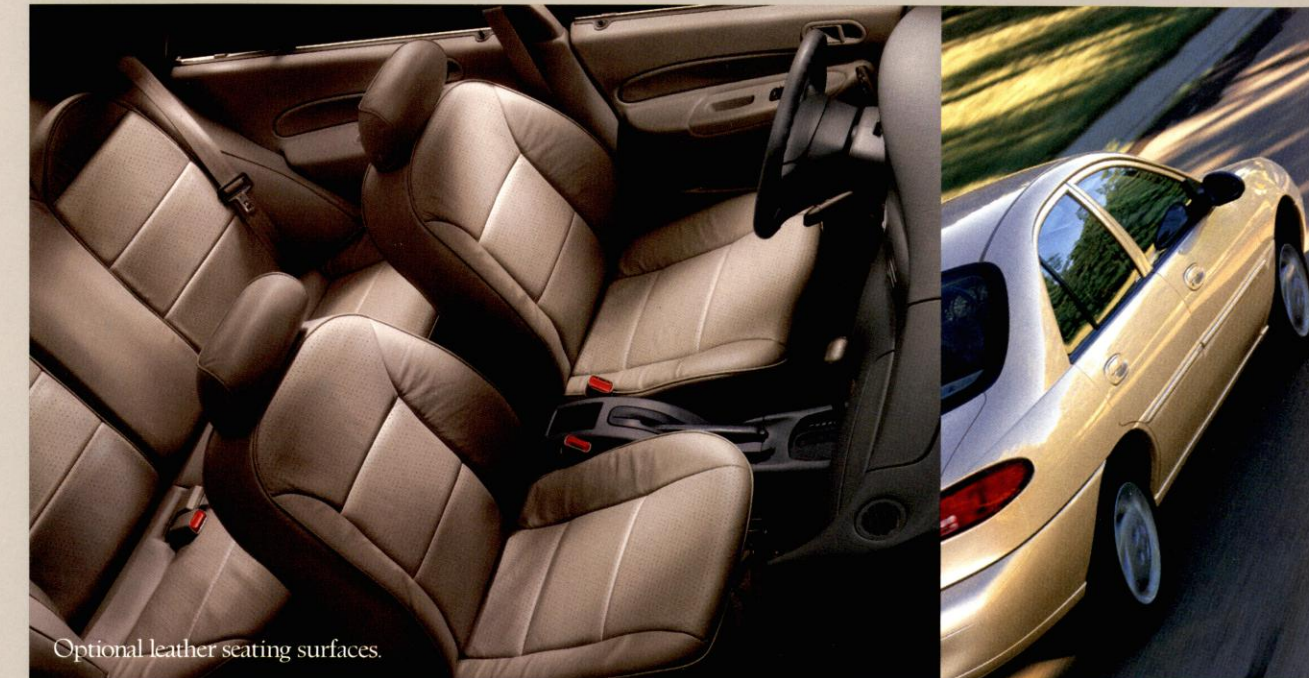
Optional leather seating surfaces.