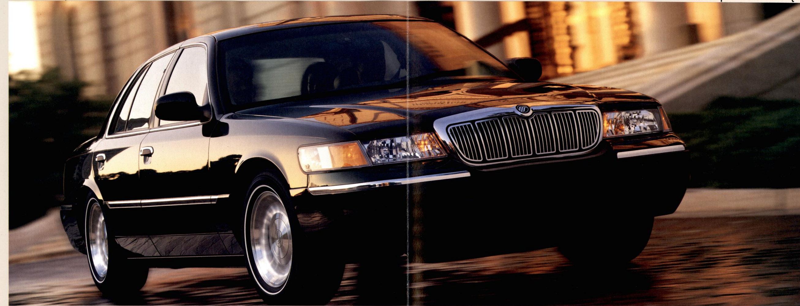
Mercury Grand Marquis