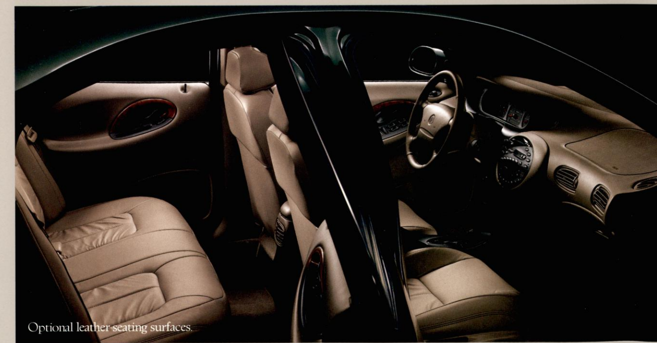
Optional leather seating surfaces.

Mercury Sable features styling that's unlike anything else out there. Sleek. Distinctive. Confident. With an expressive individuality and a spirited sense of adventure. Hey, that kind of sounds like you, doesn't it? Perhaps that's why you're so attracted to each other.