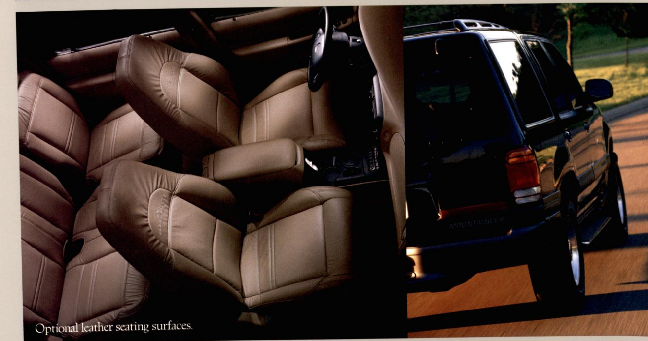
Optional leather seating surfaces.