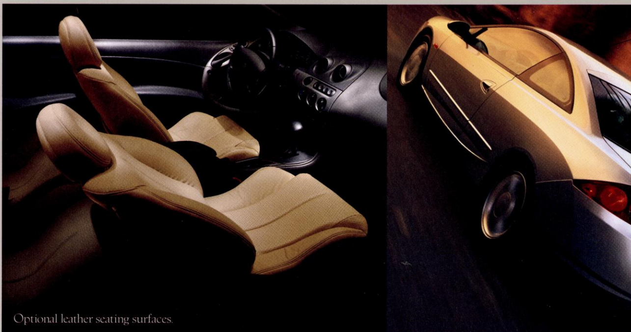
Optional leather seating surfaces.

Just wait till you get hold of a new front-wheel-drive Cougar. This is a car built for some serious fun. Its quick, sophisticated powerplant will truly excite you. And its advanced suspension system with passive rear-wheel steering delivers a taut, sports-coupe feel.