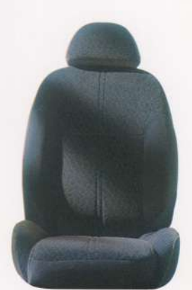
Midnight Blue Cloth