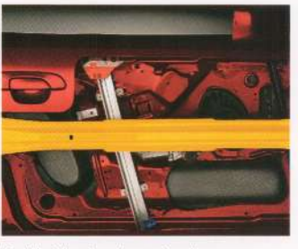
Rigid side door intrusion beams protect you in the event of certain side impacts.