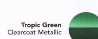
Tropic Green Clearcoat Metallic