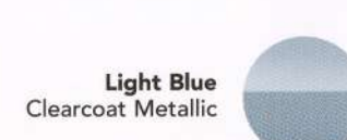
Light Blue Clearcoat Metallic