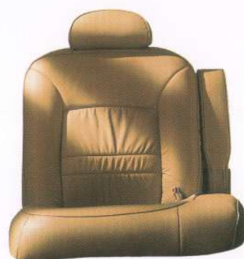
Medium Parchment Leather Trim