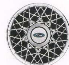
Chrome cross-spoke locking wheel covers (standard on LX)