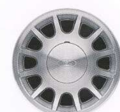
12-spoke aluminum wheels (included in LX Comfort Group and Comfort Plus Group)