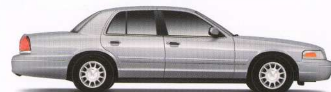
CROWN VICTORIA LX (shown with optional Comfort Group)