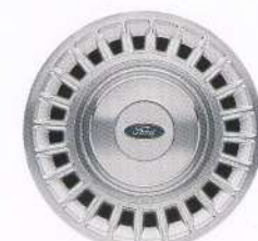
Deluxe wheel covers (standard on Crown Victoria)