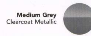
Medium Grey Clearcoat Metallic