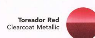
Toreador Red Clearcoat Metallic