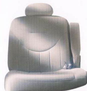
Light Graphite Cloth