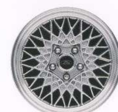
16" cast aluminum wheels (included in Handling and Performance Package)