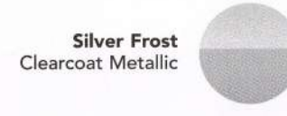
Silver Frost Clearcoat Metallic