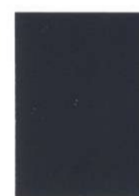
Deep Slate Blue