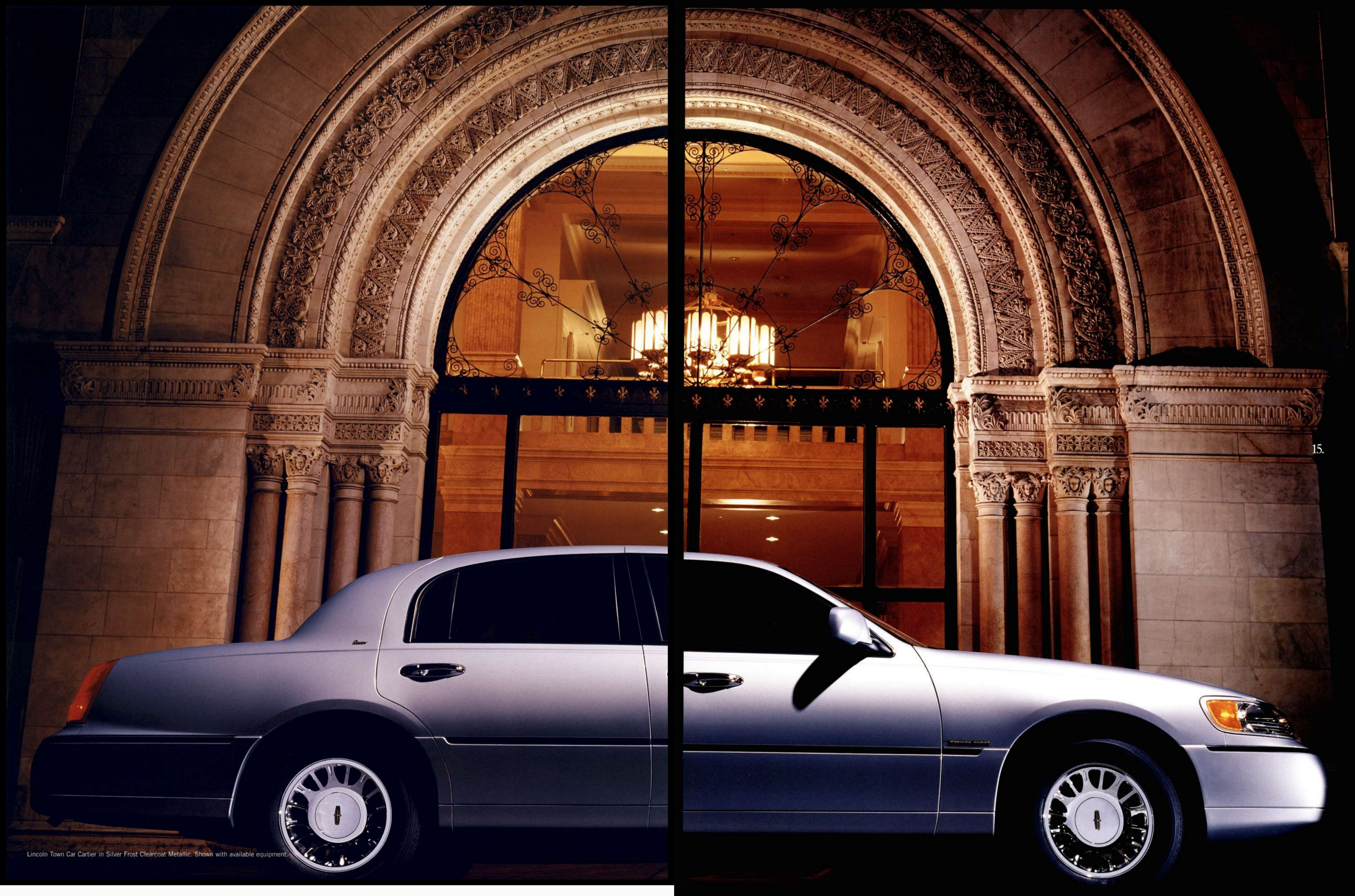
Lincoln Town Car Cartier in Silver Frost Clearcoat Metallic. Shown with available equipment.