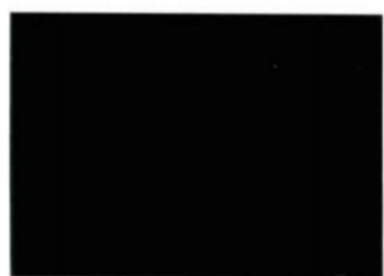
Medium Charcoal Green Clearcoat Metallic