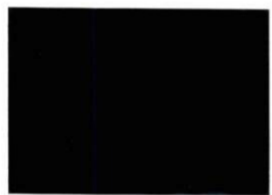
Midnight Grey Clearcoat Metallic