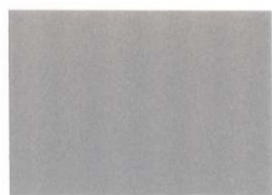
Silver Frost Clearcoat Metallic