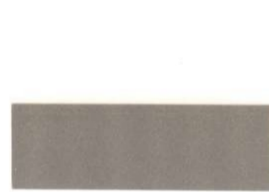
White Pearlescent Clearcoat Metallic / Light Parchment Gold Clearcoat Metallic