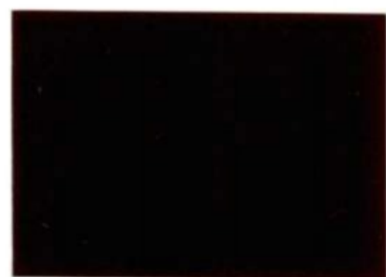
Autumn Red Clearcoat Metallic