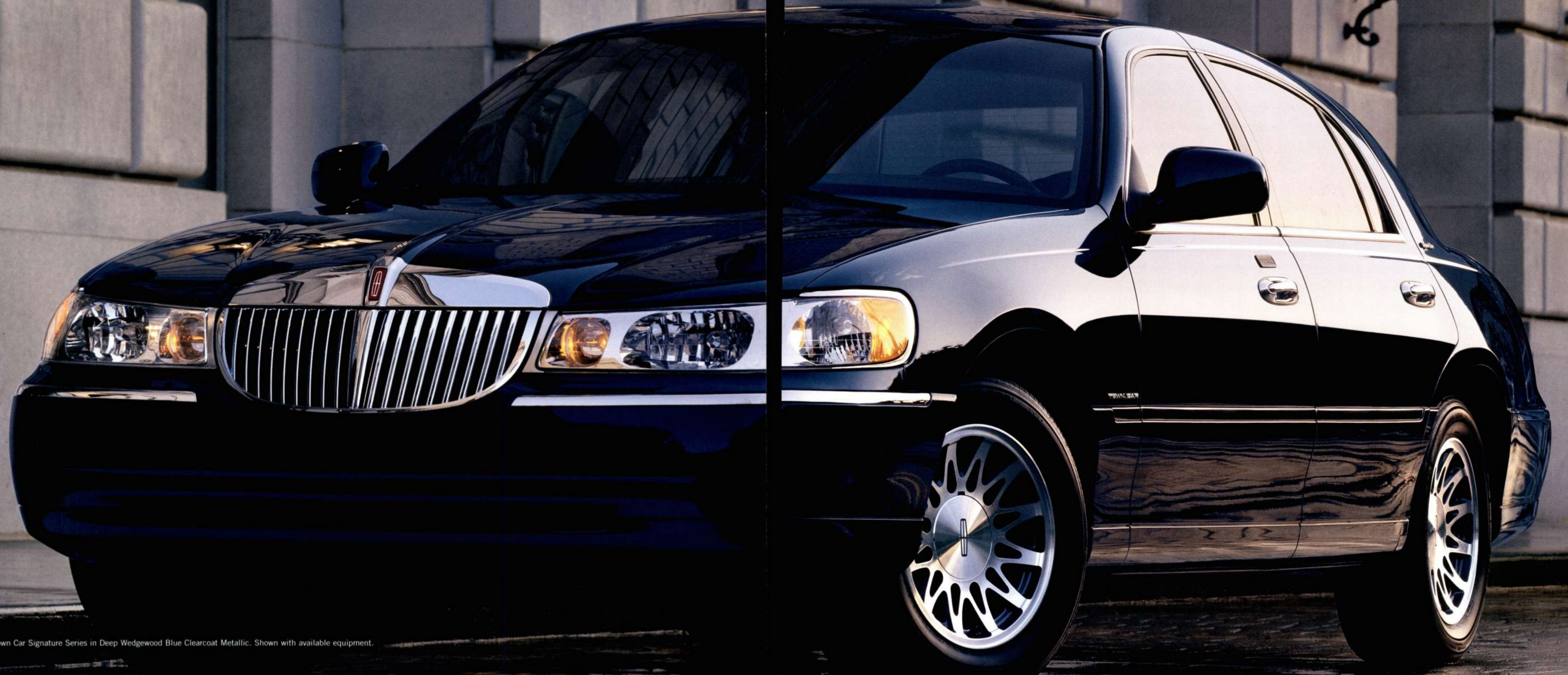
Lincoln Town Car Signature Series in Deep Wedgwood Blue Clearcoat Metallic. Shown with available equipment.