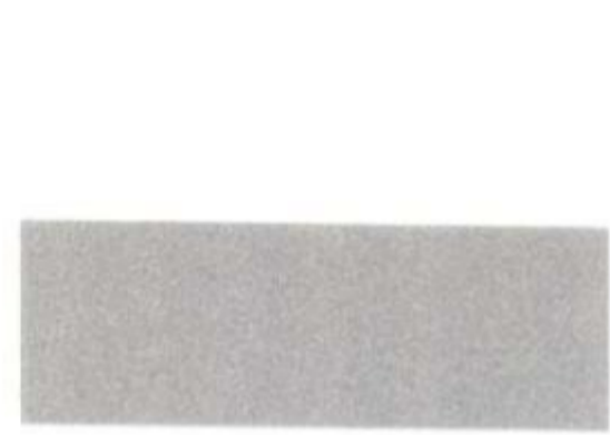
Vibrant White Clearcoat / Silver Frost Clearcoat Metallic