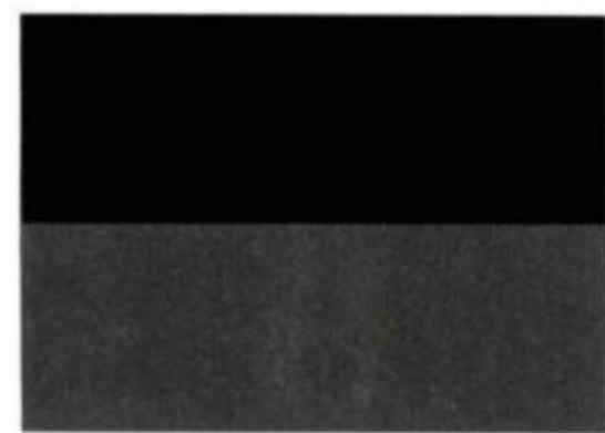
Black Clearcoat / Medium Platinum Clearcoat Metallic