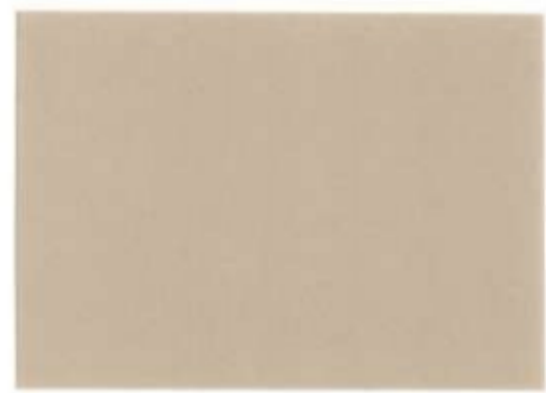
Ivory Parchment Clearcoat 1