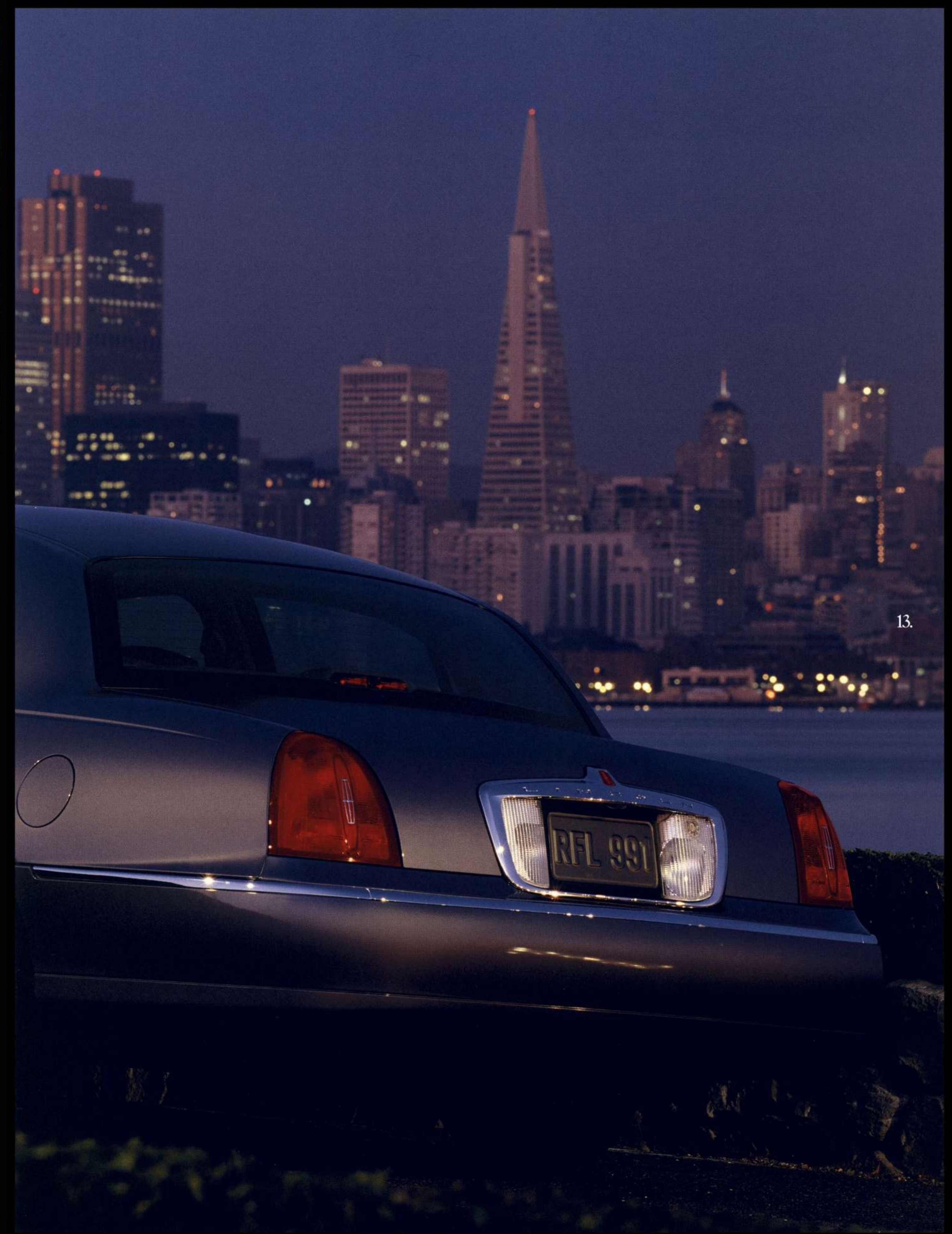
Lincoln Town Car Executive Series in Graphite Blue Clearcoat Metallic. Shown with available equipment.