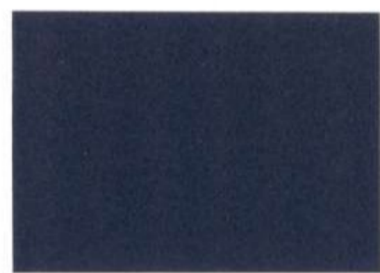
Graphite Blue Clearcoat Metallic