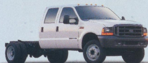
Super Duty F-450/550