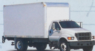
Super Duty F-650