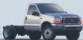
Super Duty F-350 Chassis Cab