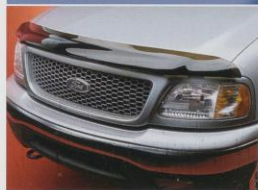
Aero Hood Deflector