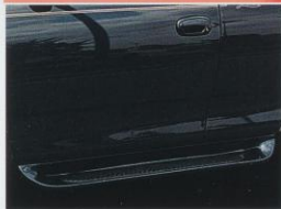
Molded Running Boards