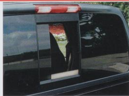
Power Sliding Rear Window