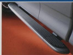
Styled Molded Running Boards