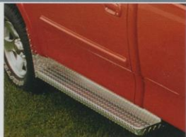
Diamond Plate Running Boards and Front Splash Guards