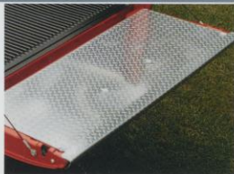
Diamond Plate Tailgate Protector