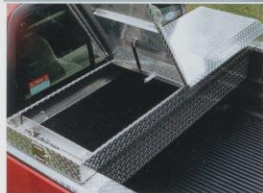
Diamond Plate Tool Box