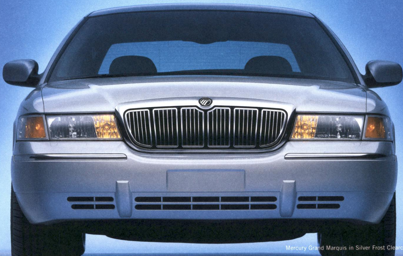
Mercury Grand Marquis in Silver Frost Clearcoat Metallic.