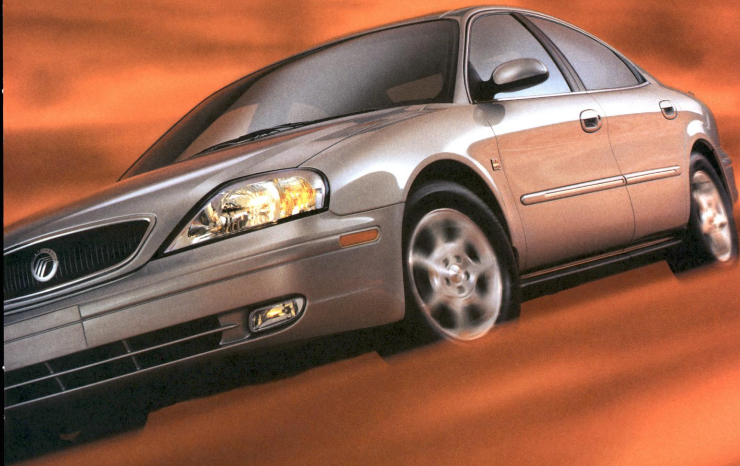
Mercury Sable LS Premium Sedan in Silver Frost Clearcoat Metallic.