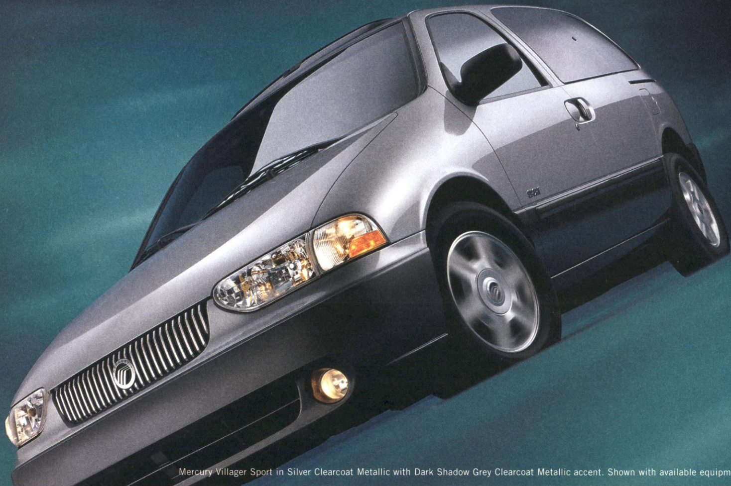
Mercury Villager Sport in Silver Clearcoat Metallic with Dark Shadow Grey Clearcoat Metallic accent. Shown with available equipment.