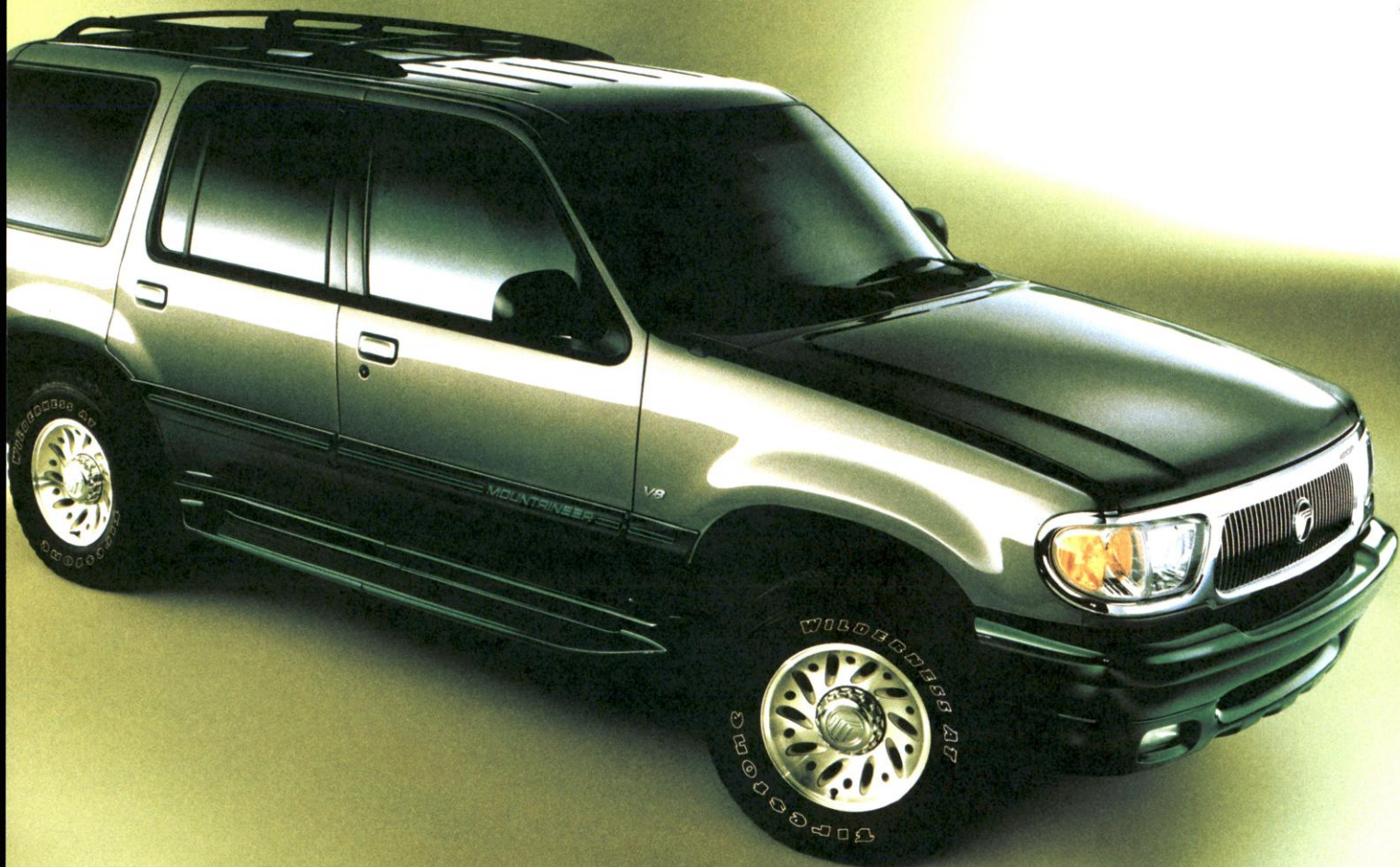
Mercury Mountaineer in Spruce Green Clearcoat Metallic with Estate Green Clearcoat Metallic accent. Shown with available equipment.