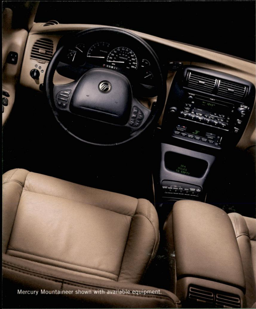
Mercury Mountaineer shown with available equipment.