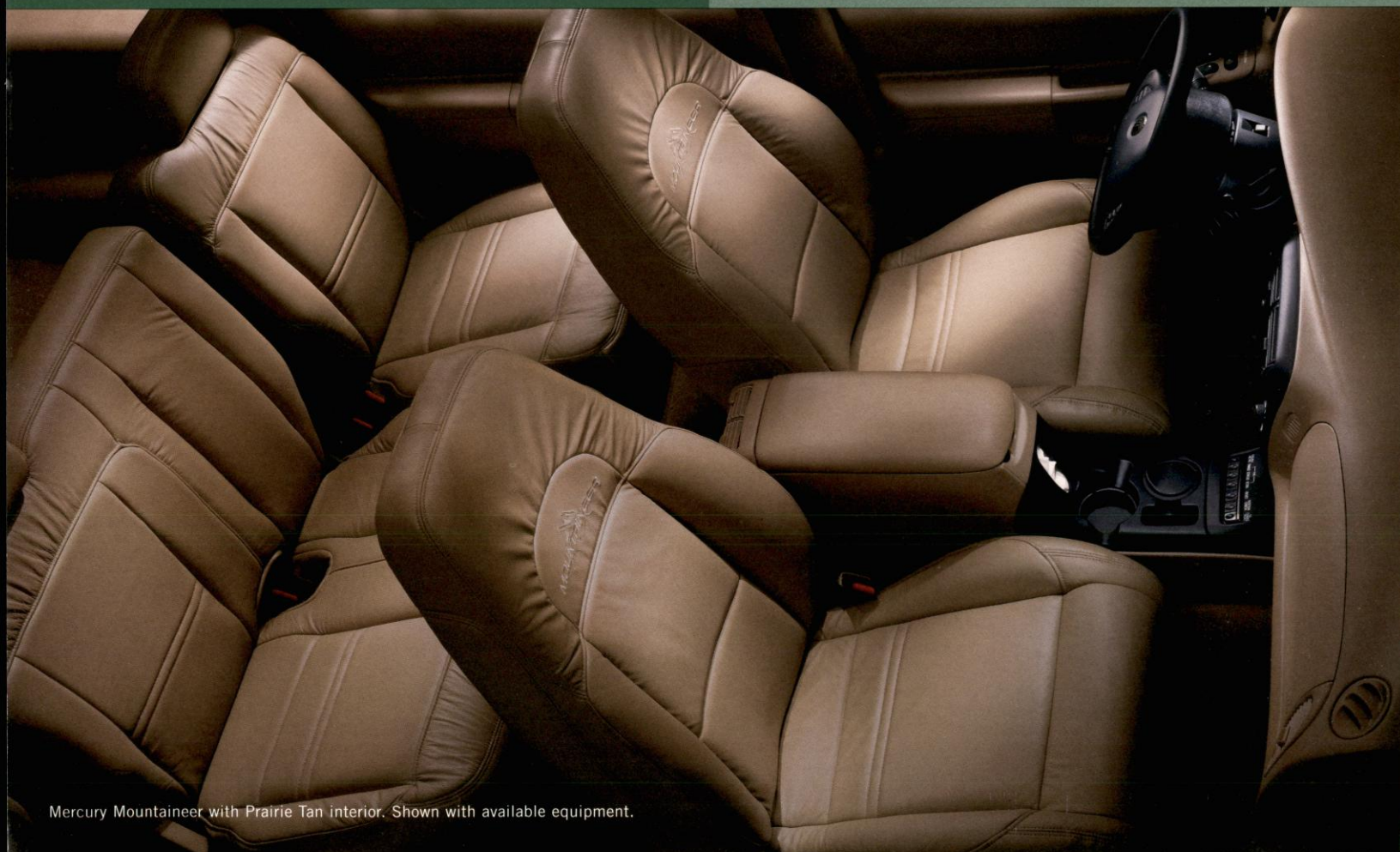
Mercury Mountaineer with Prairie Tan interior. Shown with available equipment.