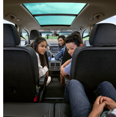
Fuel consumption figures are estimates based on Natural Resources Canada's approved criteria and testing methods. Refer to the EnerGuide 2023 for Natural Resources Canada's estimated fuel consumption figures. Actual fuel consumption will vary based on driving conditions, driver habits and the vehicle's condition, weight carried and additional equipment.

The display isn't the only thing customizable in the Atlas. The R-Line Black Package is the perfect upgrade for those wanting a sportier look. With features such as 20" Trenton black alloy wheels and Brushed stainless steel pedals, the R-Line is as bold as those who drive it. Whether you're sporty, family oriented or anything in between, the Atlas is ready for everything life throws your way. Sometimes, bigger really is better.