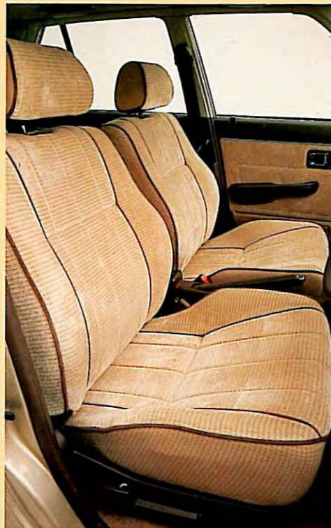
Body hugging comfort

seat; the fuel filler cap is operated from your seat as well as with the key.