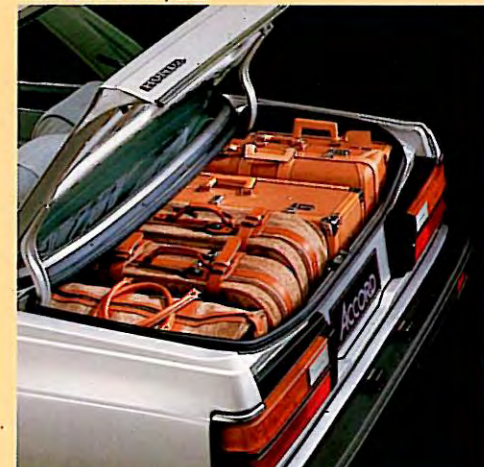
A huge accessible boot