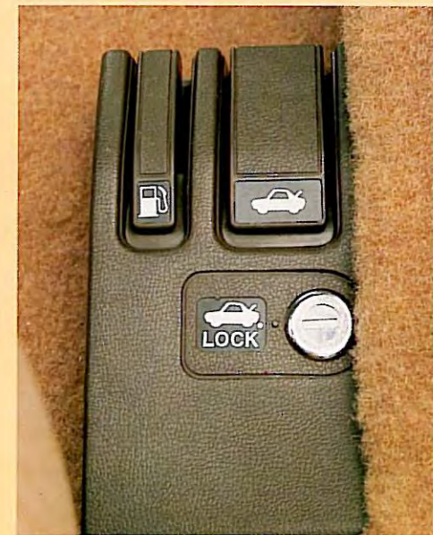
Remote release/lock systems