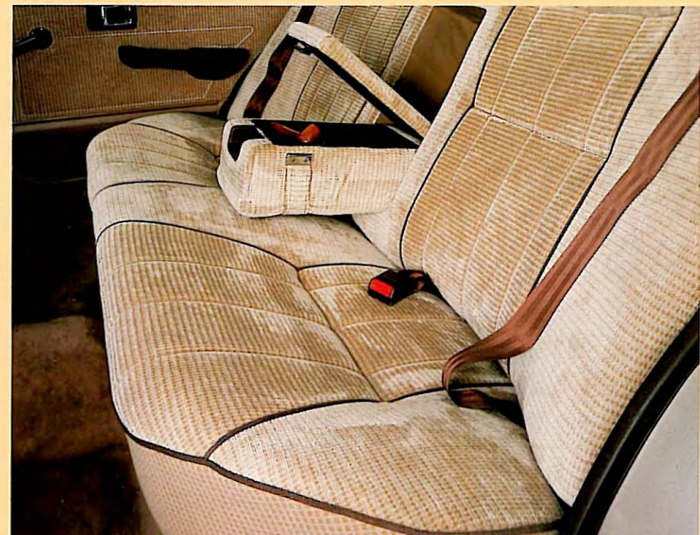
True back seat luxury