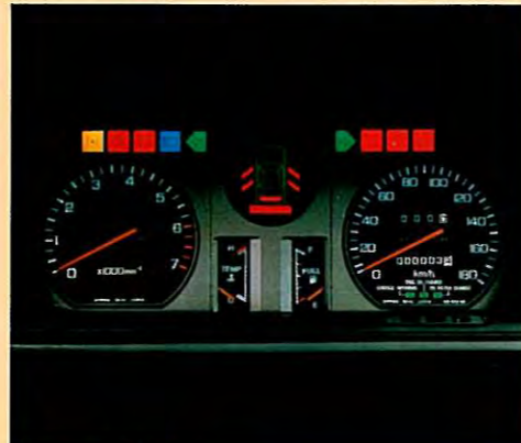
Information at a glance