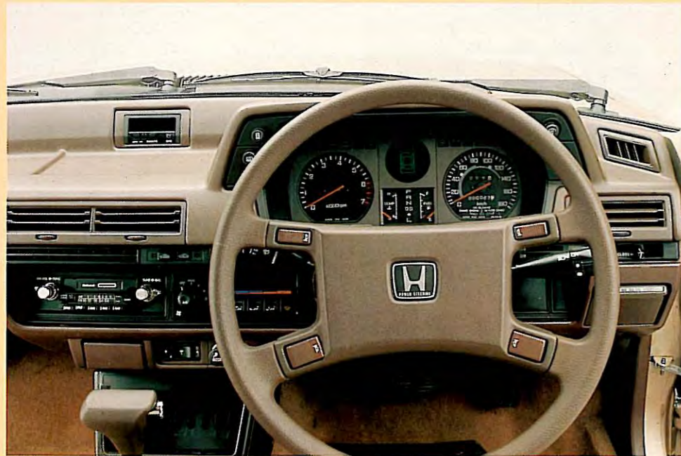
From the driver's seat showing air-con. and Hondamatic options

As you read through this brochure introducing our newest luxury saloon, you may be struck by something a little unusual when comparing it with other motor car brochures.