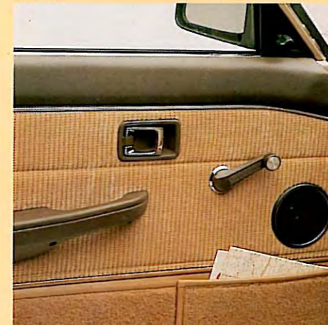
Note map pocket and carpet trim