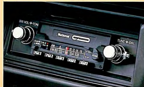
AM/FM stereo radio/cassette

Central locking means that when you lock the driver's door, all others are automatically locked too and, at the service station, you need never leave the driving