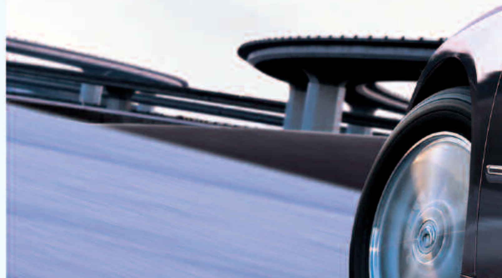
Luxury model shown

This stylish door step garnish further protects your Accord from damage, while tastefully enhancing its appearance.