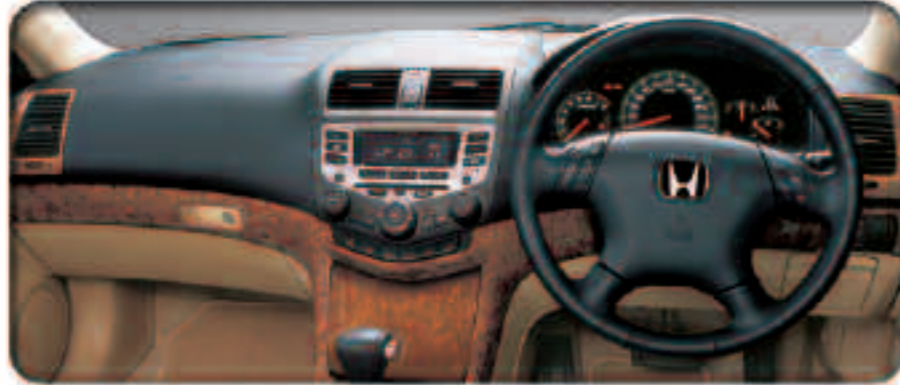
Luxury model shown

Available in woodgrain look and metallic, this is the finishing touch and perfect way to complement the interior of your Accord. The woodgrain look trim kit adds warmth, a luxurious feel and an elegant look, while the metallic finish offers a sporty, contemporary finish.*