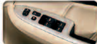
Luxury model shown

*Door switch panels not available in woodgrain look