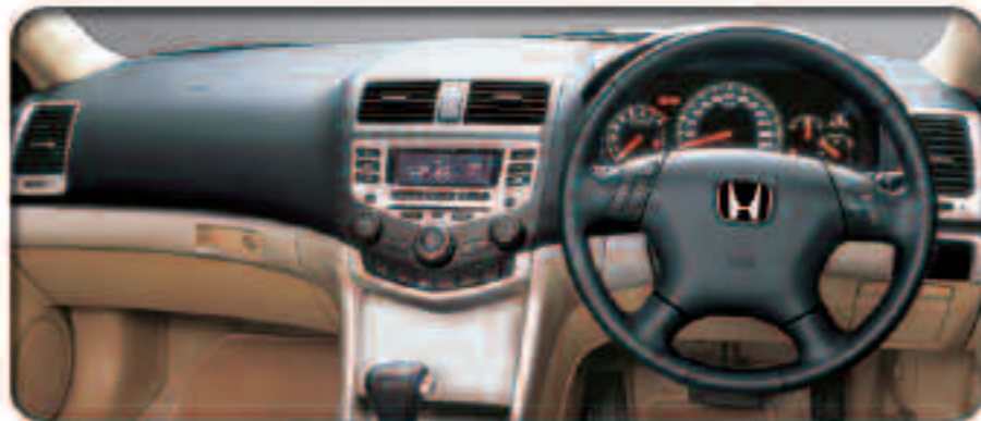
Luxury model shown