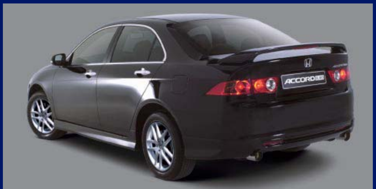
Also available; cassette player, MP3 player, fog lights, gold emblem set, gold exhaust finisher, bumper corner protector, rear bumper & boot lip protector, leather care kit, front & rear mud guards and black or ivory floor mats. Available from July 2003; towbar, bonnet protector, headlight protectors, slimline door visors, luggage tray and roof rack.