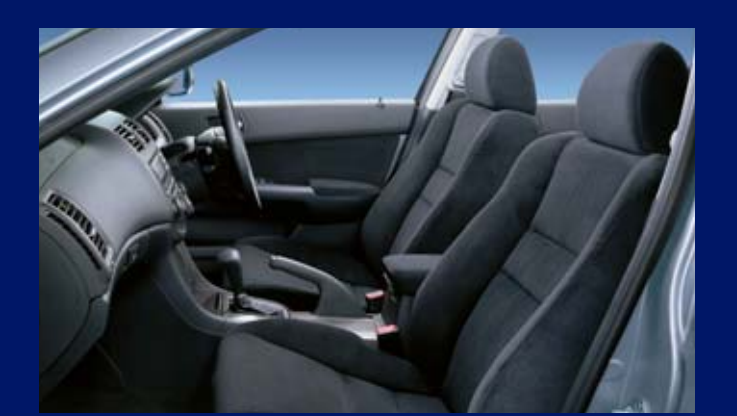
Above: Accord Euro Luxury's sumptuous leather interior<sup>†</sup> and woodgrain look trim console.

Left: Accord Euro with plush black cloth seats and metallic look console trim.