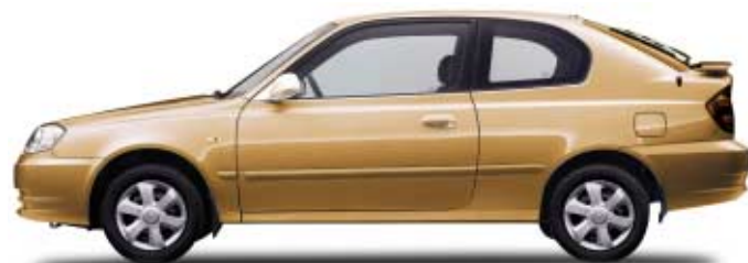
Hot Gold (Mica)