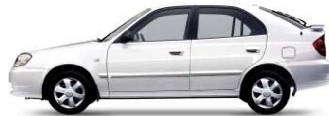
Noble White (Solid)

Current as at 01/03/2004. Part No: AC 1003S