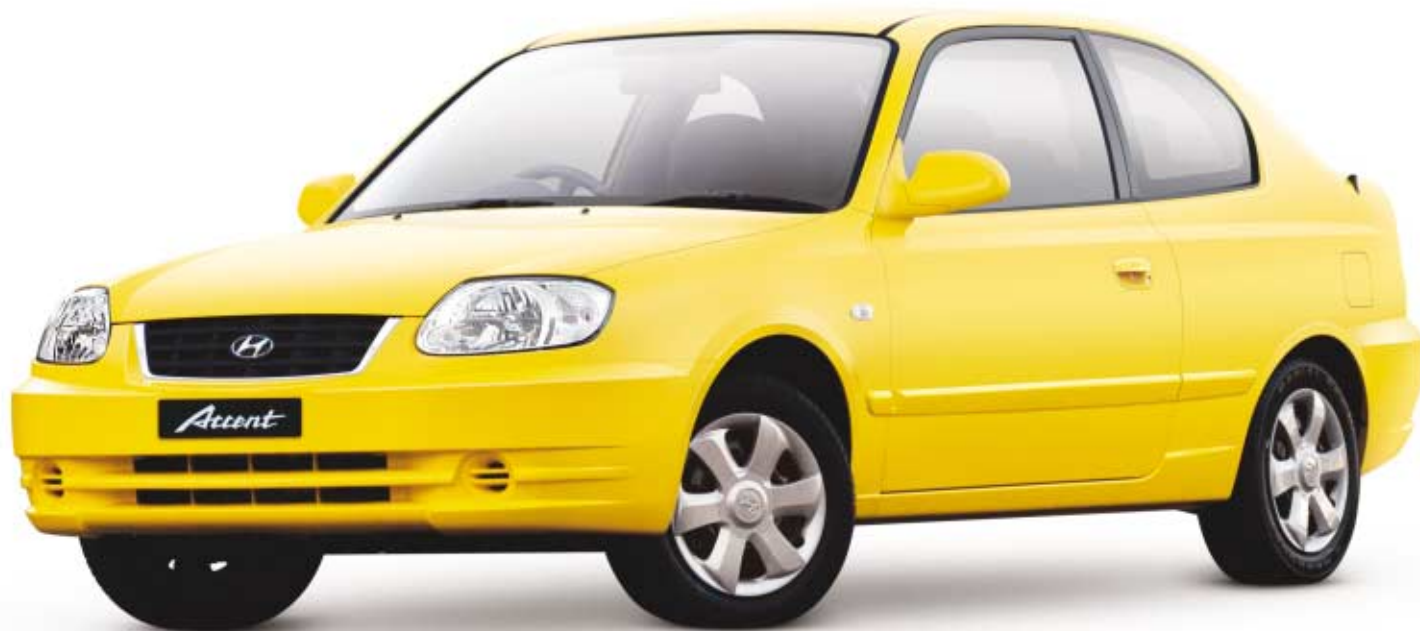
Vivid Yellow (Solid)