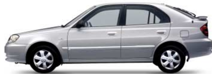
Clean Silver (Metallic)