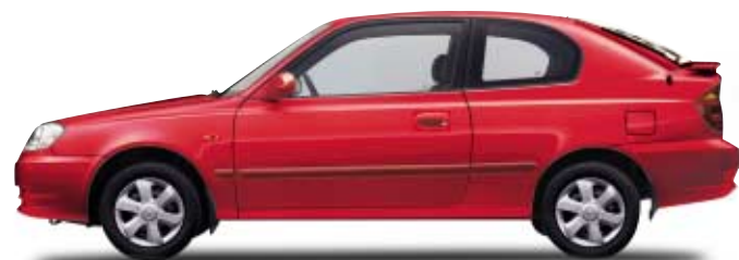
Hip Hop Red (Solid)