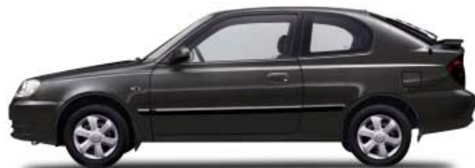
Ebony Black (Solid)