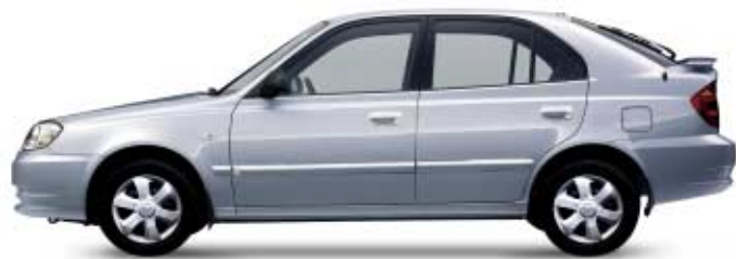
Celadon Blue (Mica)