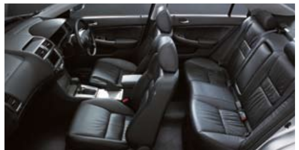
V6 Luxury model shown.