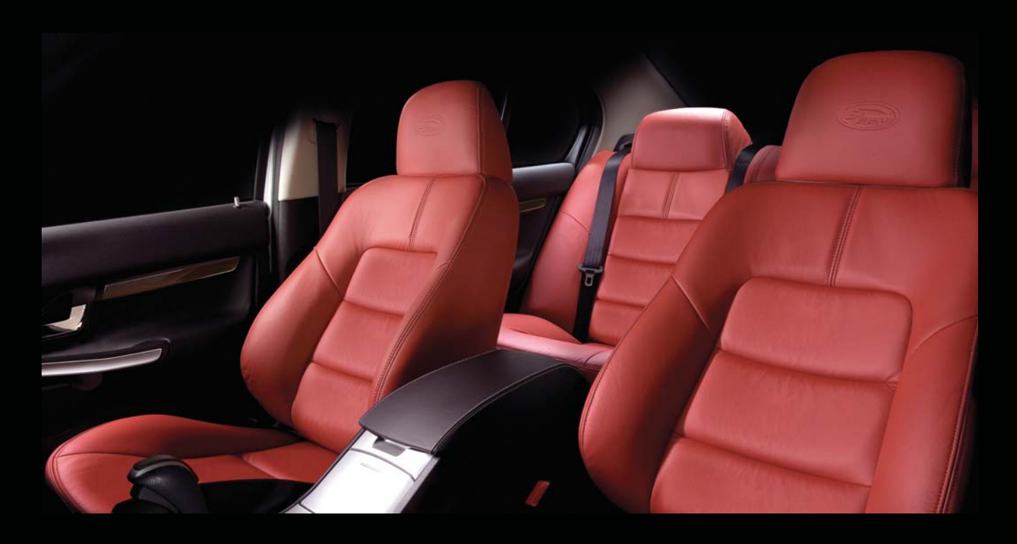
Regency Red leather seats with Dark Charcoal stitching.

The Force 6 and Force 8 interiors have been carefully crafted with an emphasis on luxury and refinement.