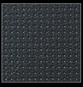
Semi-perforated leather with metallic inlay