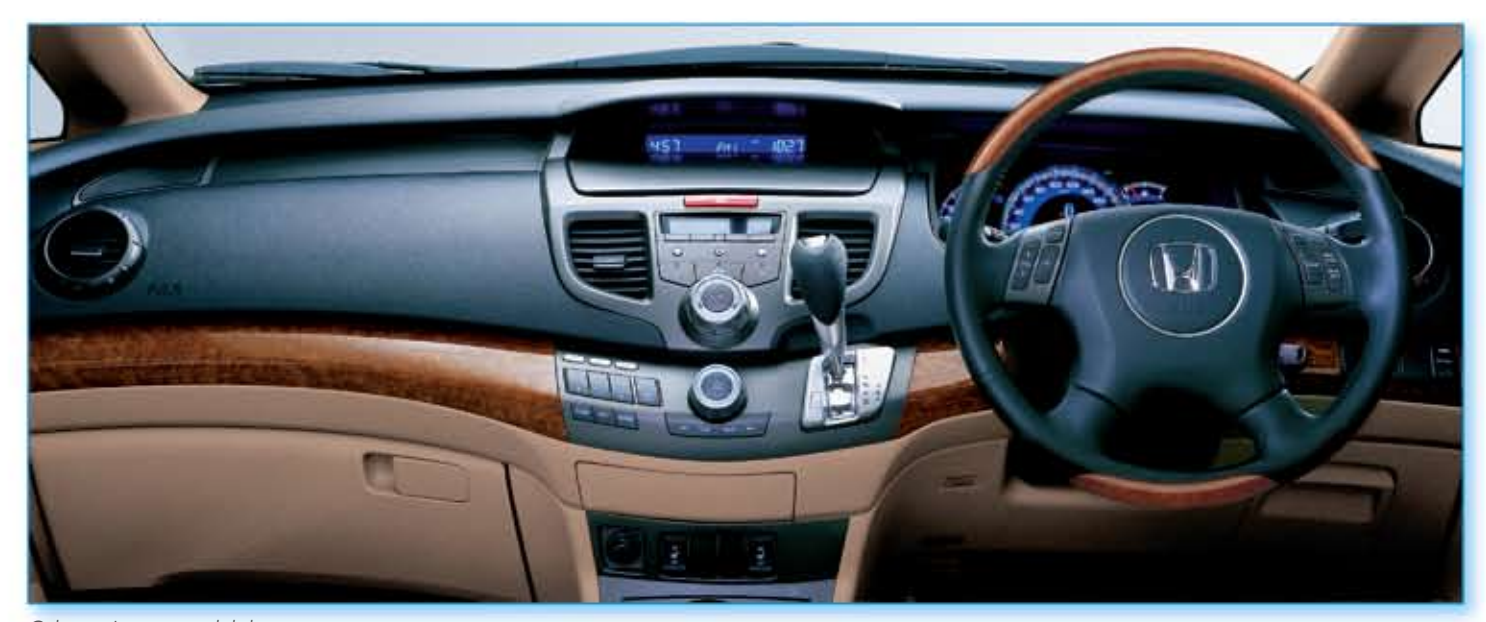
Odyssey Luxury model shown. †Leather interior includes some PVC vinyl material.