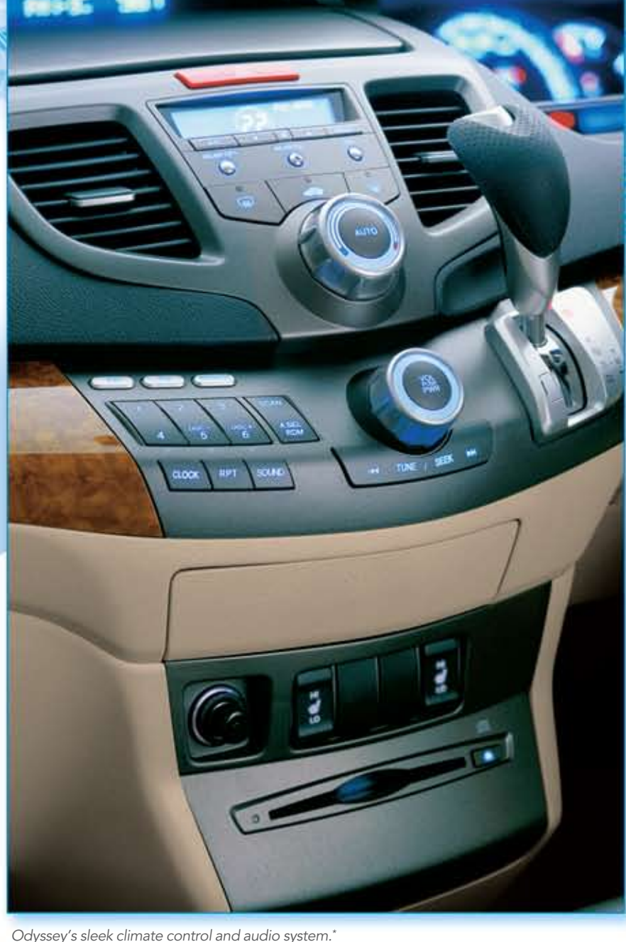
Odyssey's sleek climate control and audio system.*