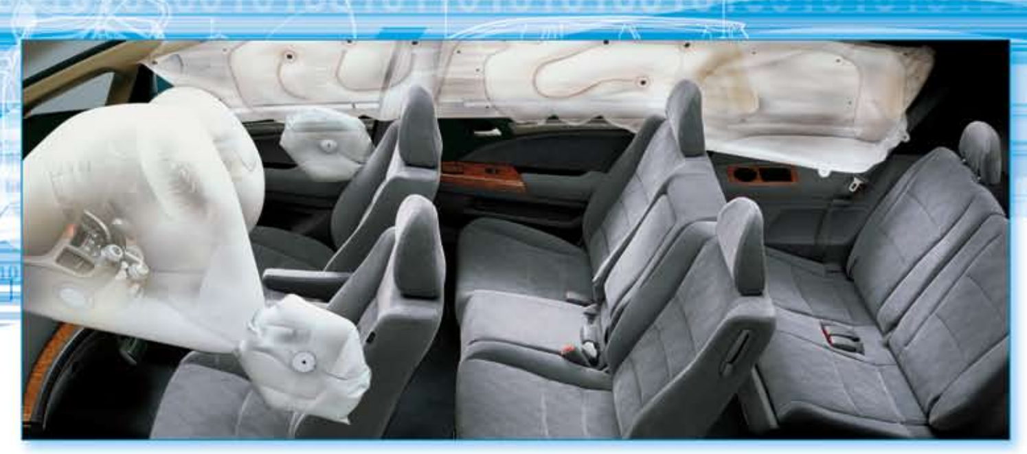
Curtain airbags available in Odyssey Luxury model.* Overseas model shown.