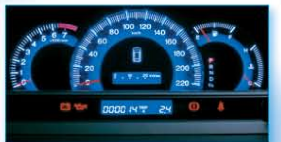
Futuristic 3D look instrument panel.*