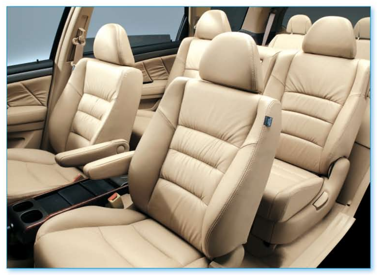
Odyssey Luxury model shown.*