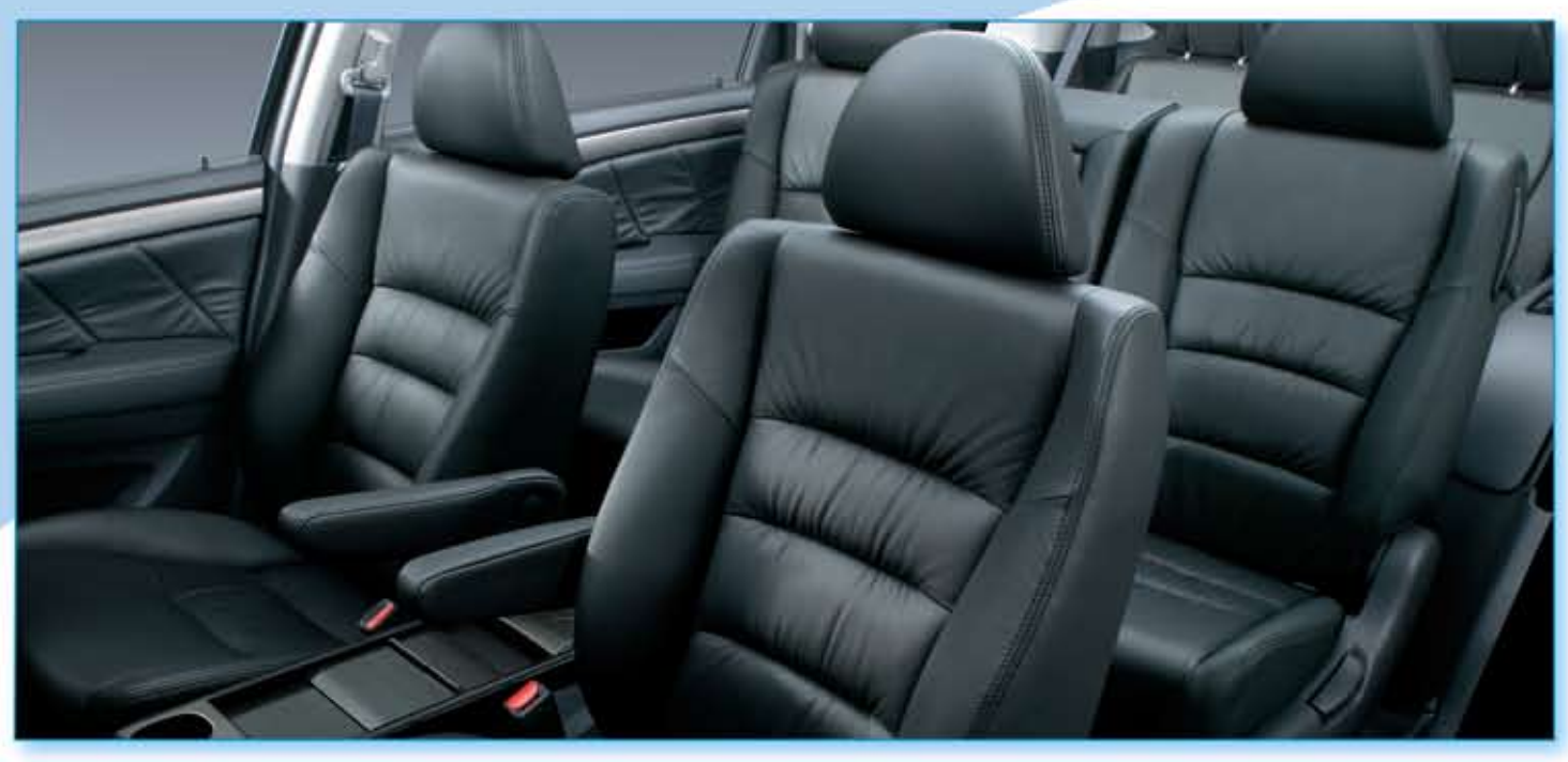
Leather<sup>†</sup> standard in Odyssey Luxury model only.