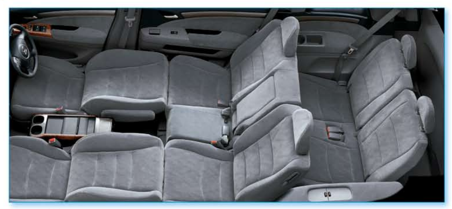
Overseas model shown.