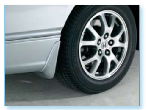
Mud guards (Cannot be fitted with body kit components. Front & rear sold separately.)

This means your tailor-made Honda Odyssey will be unique to you.