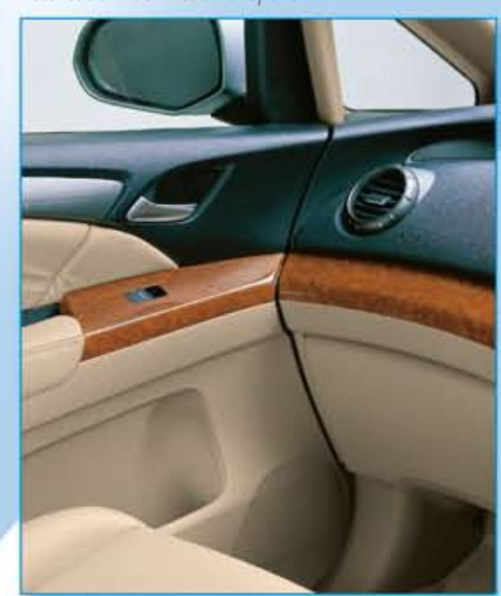
Woodgrain look panelling standard on Odyssey.*