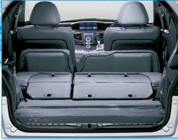
Overseas model shown.