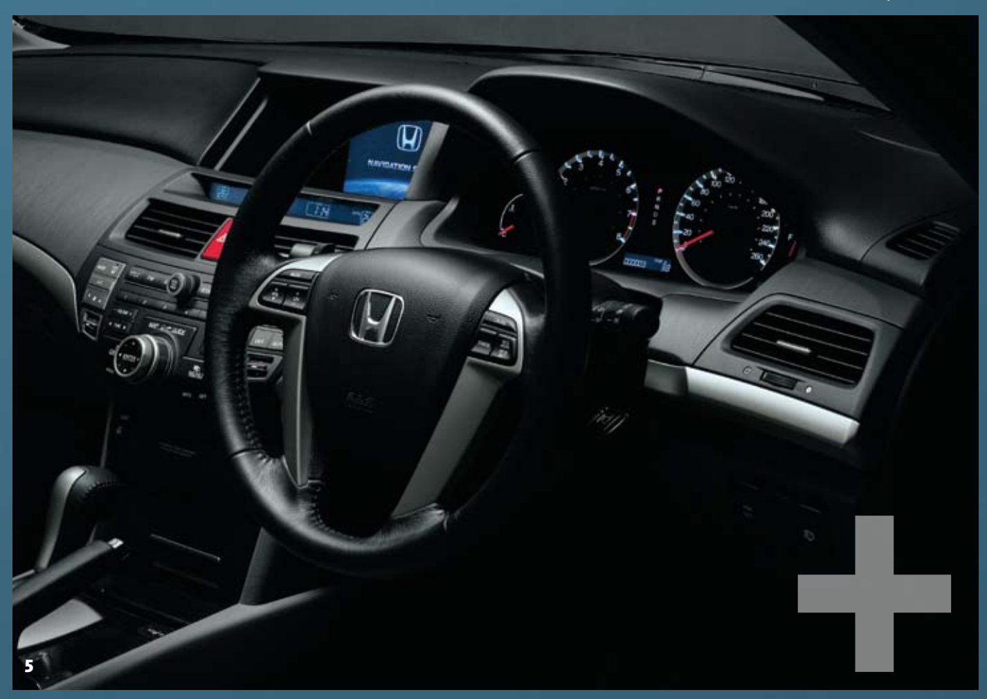
V6 Luxury model shown.