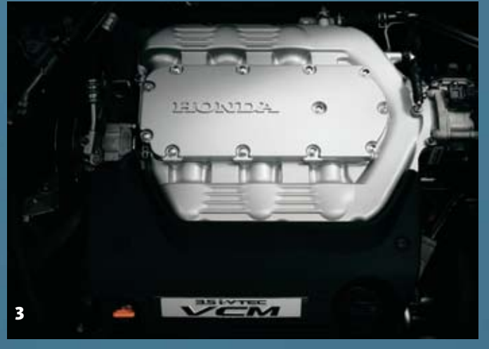
V6 model shown.