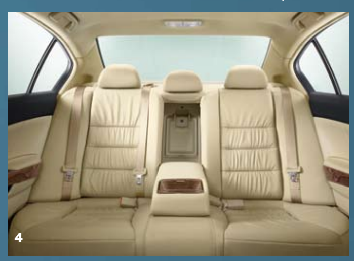
VTi Luxury model shown.