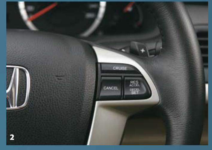
VTi Luxury model shown.