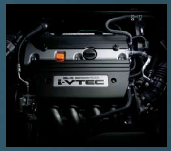
Like its big brother, the four cylinder, 2.4 litre Accord is also among the most powerful in its class.

Its DOHC i-VTEC valvetrain system produces 133kW of power and 222 Nm of torque. This is an increase over the previous 2.4 litre Accord engine, and it comes, in part, from a higher compression ratio and related engine tuning. And at 8.8L/100km, the engine's impressive performance is matched by equally impressive fuel consumption and low CO2 emissions.