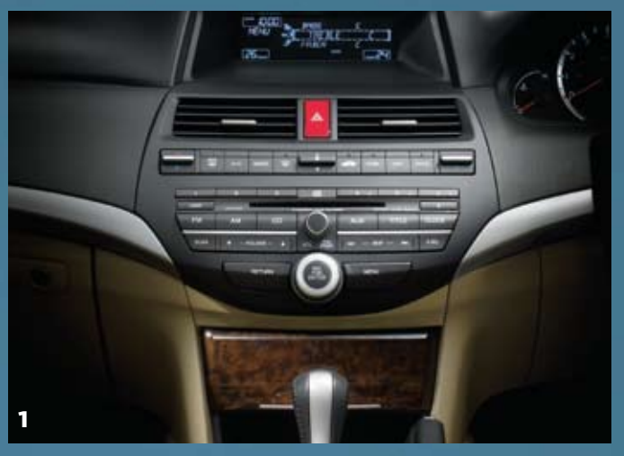
VTi Luxury model show