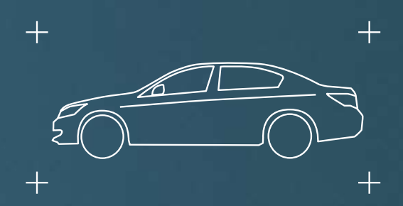
The 2.4 litre engine in the all-new Accord is very close to perfection.