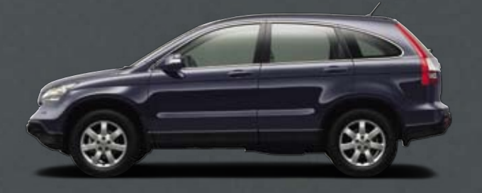
Sparkle Grey Pearl* Interior trim: Black

* Metallic / Pearlescent paint additional co