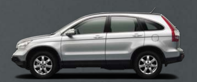
Alabaster Silver Metallic* Interior trim: Black