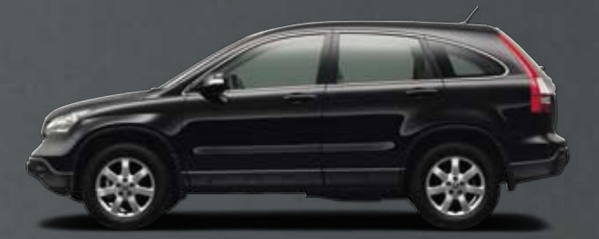
Nighthawk Black Pearl* Interior trim: Black or Ivory

Obviously the world would be a better place and the good news is, such a car already exists: The FCX Clarity. It works by converting hydrogen into electricity, which leaves you with only one emission, H2O. And in 2008, this totally new fuel-cell vehicle will be in production.