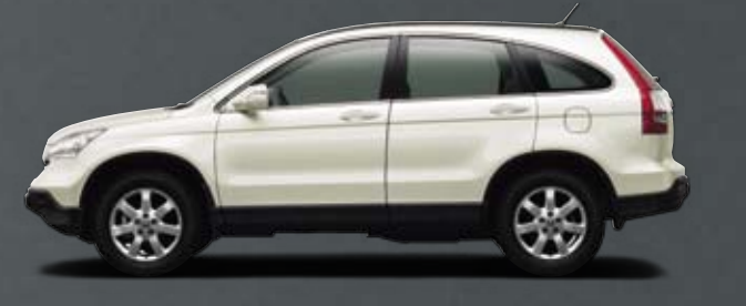
Taffeta White Interior trim: Ivory