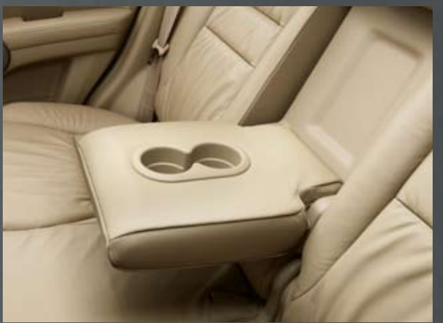
CR-V Luxury model shown