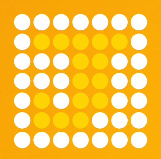
Long mode Recline the left seats to fit long, wide objects