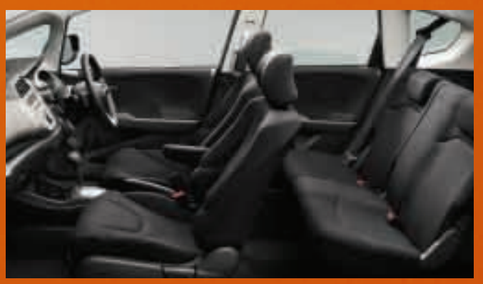
Black interior (VTi-S mode