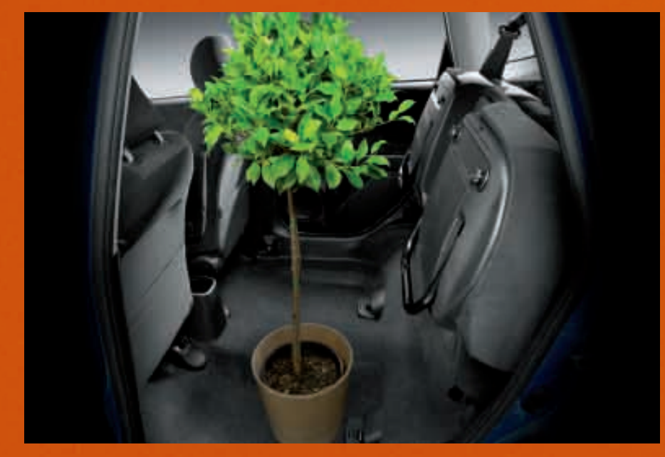
Tall mode Raise her back seat cushions to fit taller objects.