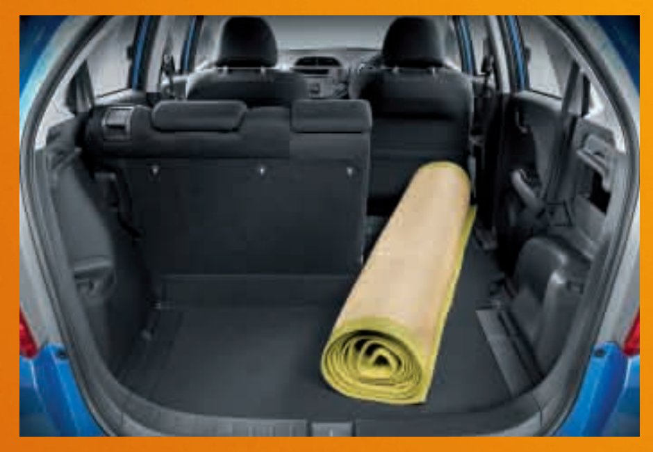
Long mode Recline the right seat to fit long, thin objects,