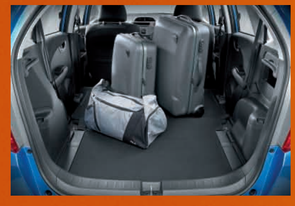
Utility mode With the back seats down, you'll have all the room in the world.

In Tall mode, raise her back seat cushions to fit four large suitcases or perhaps a tall shrub sitting upright. In Utility mode, fully collapse her rear seats to make space for your bicycle or just about anything else. And in Long mode, recline her front and rear seat to create a space long enough to fit a surfboard. If you're not into surfing, try a pair of skis. Or maybe hockey is more your thing. Well, anyway you get the point.