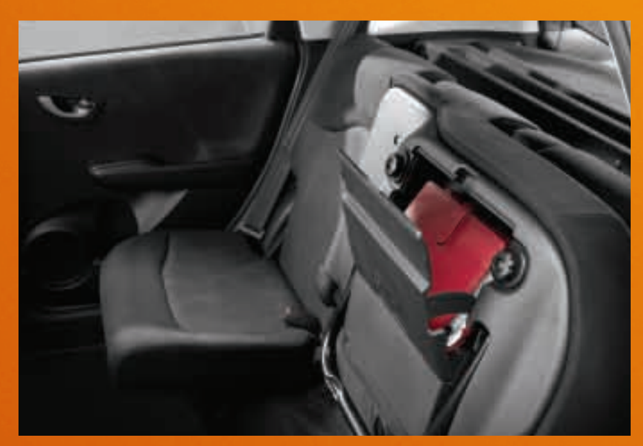
Secret Storage Case You can hide anything and everything from everyone.