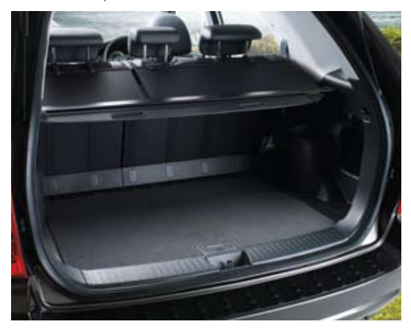
...to carry whatever you need for your escape