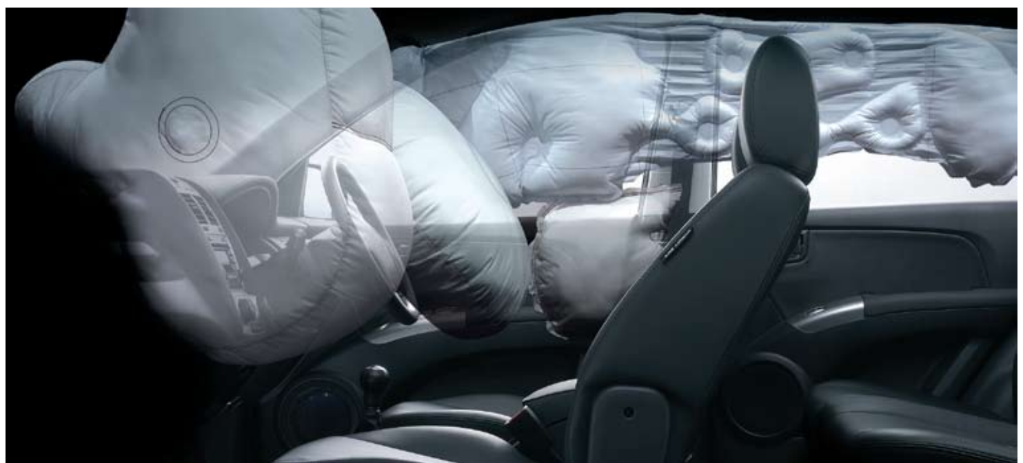
*Left-hand drive model tested. 1. ESP and TCS are available as part of the Option Pack on Sportage LX auto and as part of the Limited Pack on EX V6 and CRDi models. Consult your Kia dealer for details. 2. Front-side and curtain SRS airbags are components of the Option Pack on Sportage LX auto and the Limited Pack on EX V6 and CRDi models. Consult your Kia dealer for details.