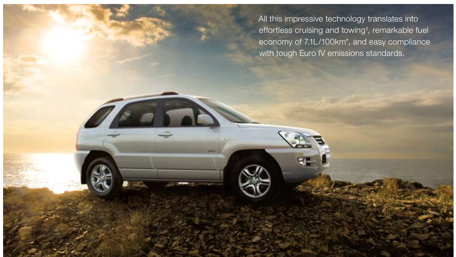
<sup>1</sup> Up to 1,600kg, braked trailer. *Combined cycle. ADR 81/01.