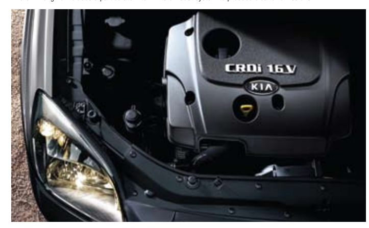
Sportage EX CRDi