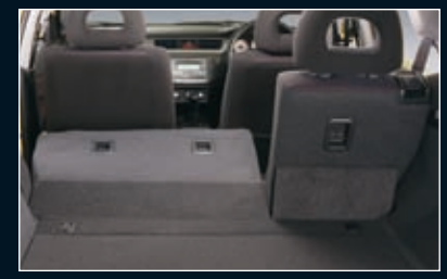
60:40 SPLIT FOLD SEATS