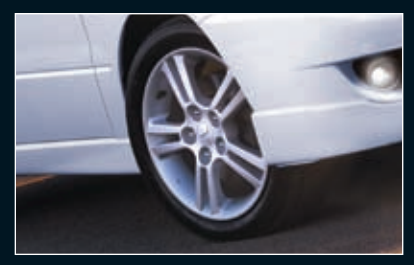
16" ALLOY WHEELS (VRX)