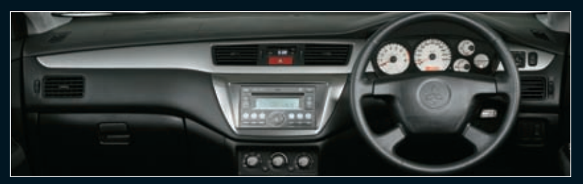
VRX SPORTY INTERIOR