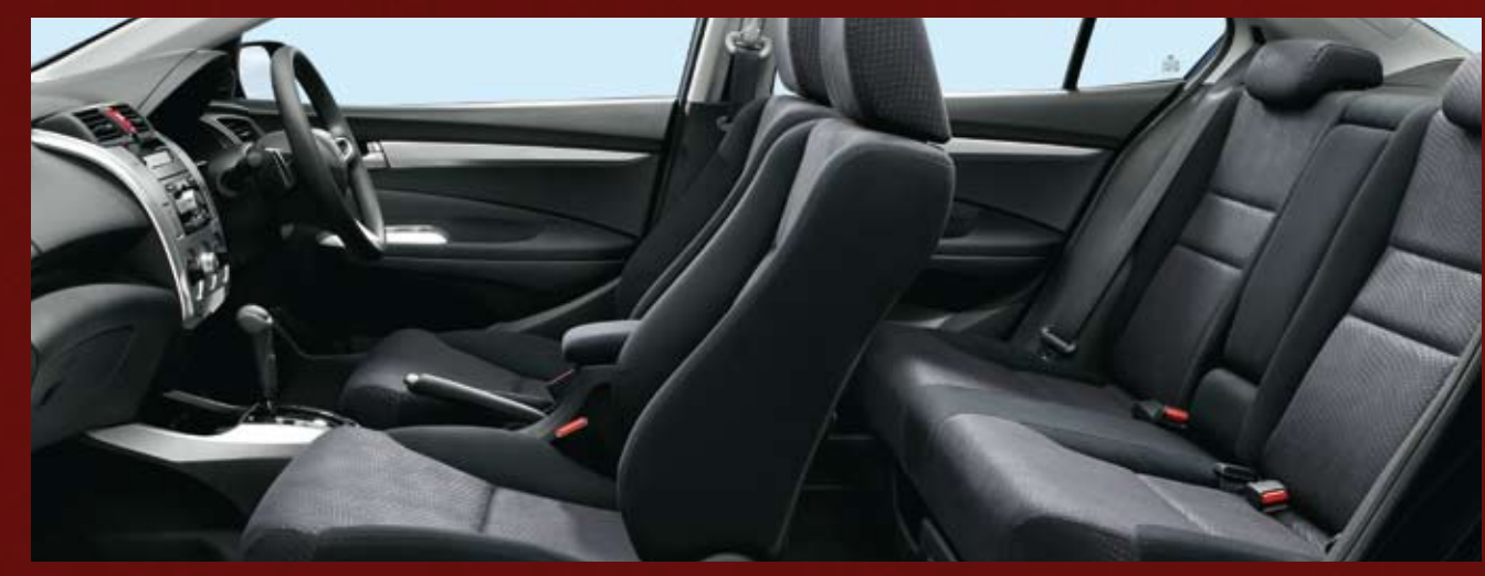
VTi comes with Black interior. VTi-L comes with Premium Black interior (as shown above).