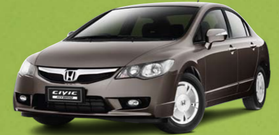
Urban Titanium Metallic*