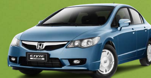
Neutron Blue Metallic*