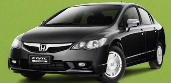
Crystal Black Pearl*

Every way you look at it, it looks great.