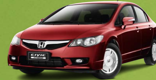
Bright Red Pearl*