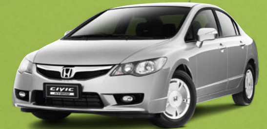
Alabaster Silver Metallic*