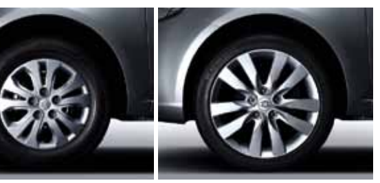
195 / 65R 15" Steel Wheel

Designed from the ground up. The all-new Cerato comes with 15-inch steel wheels with a single 5 split-spoke cap style. While the all-new Cerato SLi model is equipped with the ultimate 5 split-spoke 17-inch alloy wheels.